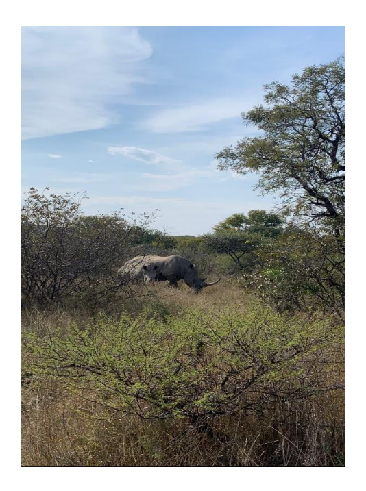
Evaluation Office of the United Nations Environment Programme Distributed: November 2023