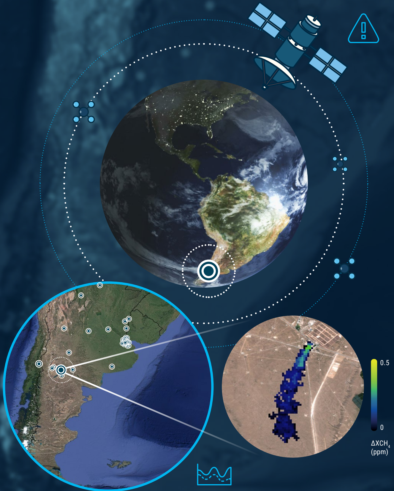
Figure 1 Estimated location of methane emissions events between Jan 2021 and Aug 2023. Dots are TROPOMI-detected plumes; inset map is EMIT detection in Argentina.