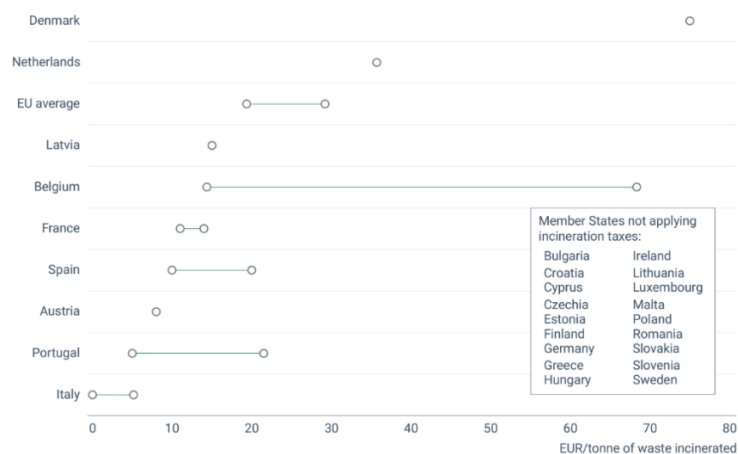
Figure 2 Overview of the taxes on the incineration of municipal waste used in EU Members States, 2023

Further details are available in the Technical note accompanying the EEA briefing 'Economic instruments and separate collection – key instruments to increase recycling' (EEA 2023a).