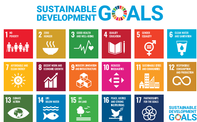
Figure 1: The Sustainable Development Goals of the 2030 Agenda for Sustainable Development

positive impacts as contributors on sustainable development is imperative. Integrating gender perspectives in policy coherence for sustainable development fosters outcomes that are both inclusive and equitable.