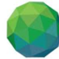
GREEN CLIMATE FUND