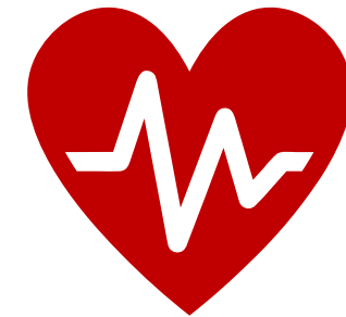
Performance Monitoring and Reporting