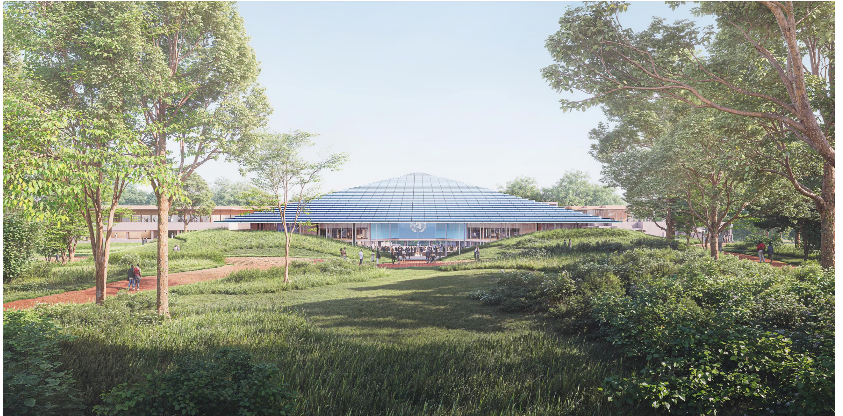
Render of New Assembly Hall – Front Elevation