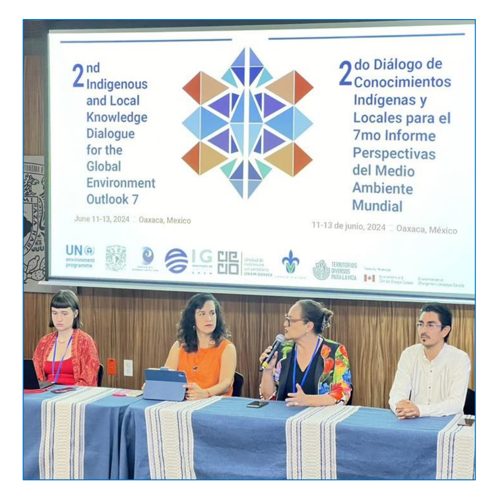
2<sup>nd</sup> Dialogue, Oaxaca, Mexico