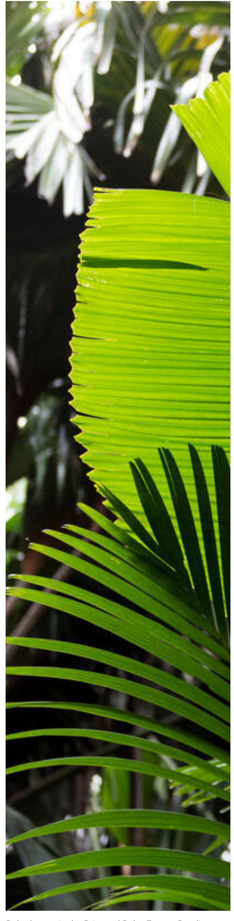
Palm leaves in the Primeval Palm Forest. Praslin Island, Seychelles.