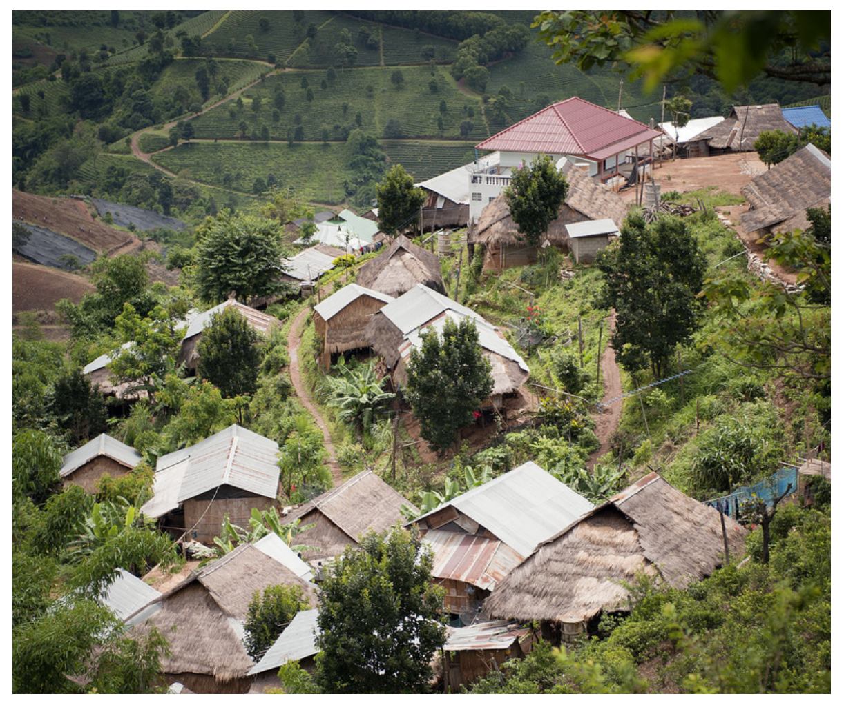
A view of Mae Salong, in the northwest of Chiang Rai Province. The forested area around Mae Salong is home to several hill tribes. Chiang Rai, Thailand.

This is important because empowering IPLC organizations to effectively fight for their rights is probably the best strategy and safeguard against perpetrators of human rights in the name of biodiversity conservation. On the side of private conservation actors and funders, some form of human rights compliance mechanism, whether voluntary or state sanctioned, will also be necessary to hold non-state conservation actors and funders accountable for their actions in the human rights sphere. One hopes too that state actors, as duty bearers, will also be inspired by these Core Principles to better protect human rights in their conservation work.