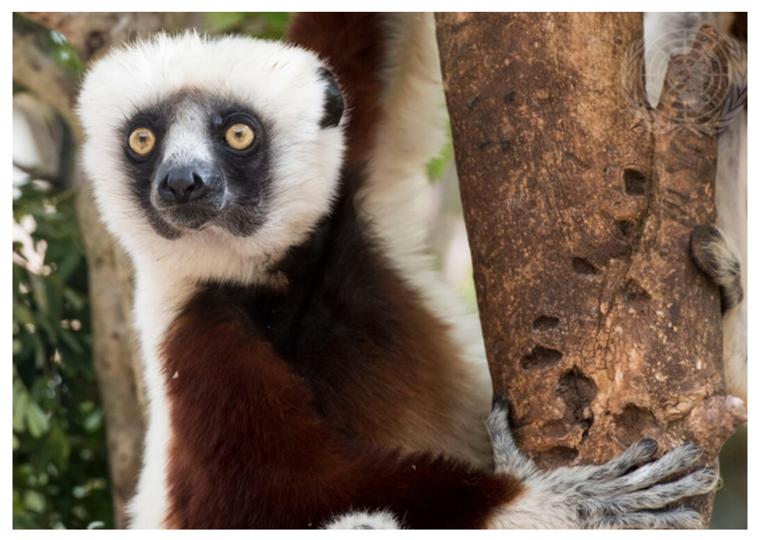
Lemur, a small primate endemic to the island of Madagascar. Antananarivo, Madagascar.

Equally important to the Principles is the dialogue and consultation process that they are built upon. An ongoing dialogue that contributes to, and learns from, conservation practice remains essential. We will continue to engage in these discussions to foster relationships that will strengthen conservation and human rights collectively.