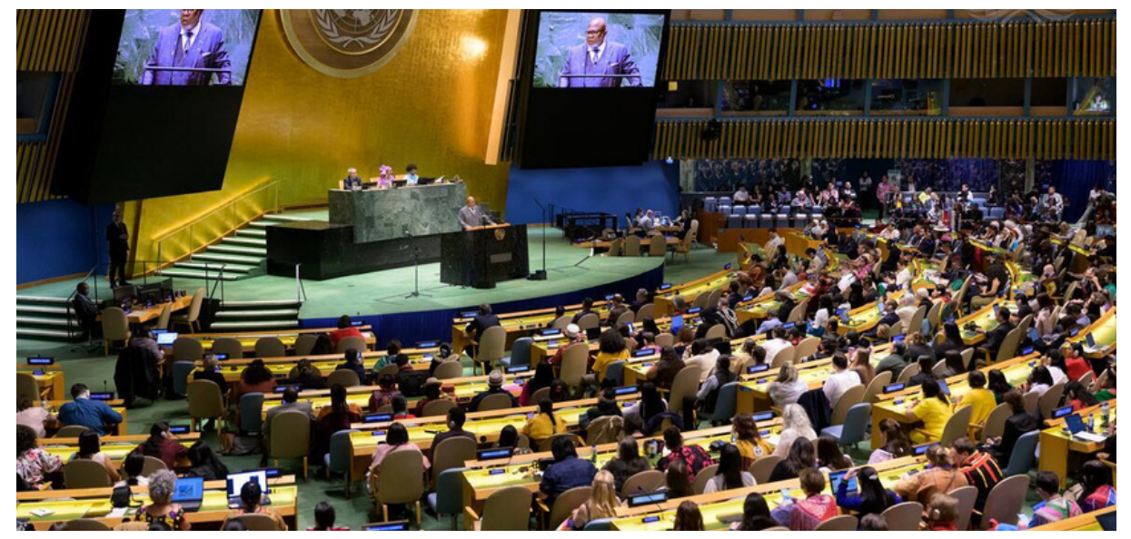
Opening of the 23rd Session of the Permanent Forum on Indigenous Issues. New York, United States.

Recognizing that the Principles are perfectible and seeing them as a tool towards improving knowledge, implementation and respect for human rights, I invite private conservation organizations and foundations to learn about these Principles, subscribe them and implement them effectively, to further contribute to respect, protect and guarantee all human rights, including, of course, the human right to a clean, healthy and sustainable environment for everyone, everywhere.