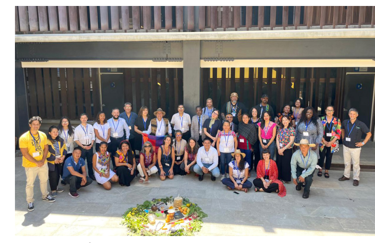
Participants of the 2nd IK&LK Dialogue in Mexico

The third in-person Indigenous Knowledge and Local Knowledge dialogue (IK & LK) for GEO-7 will take place in Chiang Mai, Thailand from 13 to 15 January 2025 at the Amora Thapae Hotel, Chiang Mai, with a field trip to Huay E-Khang Village on 12 January. The meeting is co-hosted by the United Nations Environment Programme (UNEP) and the Asia Indigenous Peoples Pact (AIPP). This dialogue will focus on the review of the Second Order Draft (SOD) of GEO-7, the IK & LK Chapeaux and the First Order Draft (FOD) of the Summary for Policy Makers (SPM), specifically to provide feedback on the IK & LK content.