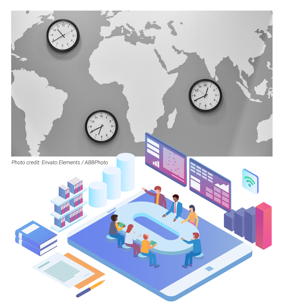
Vector credit: Envato Elements / naulicrea

Prior to the in-person dialogue, two virtual dialogues were scheduled for 4 November and 4 December 2024. The objective of the first virtual meeting held on 4 November was to help participants understand the structure of GEO-7 and how to contribute to the GEO-7 review process. There were two identical sessions scheduled to cater for participants from the different regions and time zones. The objective of the second virtual meeting was to present logistics of the 3 Dialogue, and possibly give time for the participants to have a caucus session before the in-person dialogue. The session also had two identical sessions of 3 hours each, planned to accommodate participants from different regions and time zones.