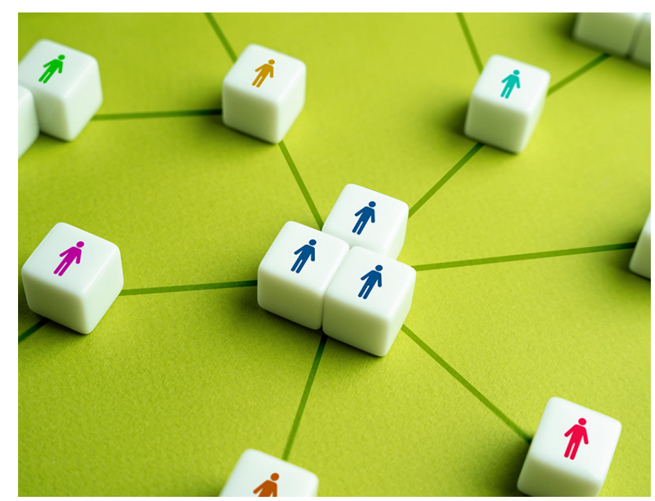
Vector credit: Fnyato Flements / il ixe48

Other examples include the GEO-READ peer review platform developed and maintained by CEDARE which is critical to organizing the many thousands of comments received during peer review and is a key tool for review editors to ensure GEO's credibility and relevance can be demonstrated and many collaborating centres have also provided nominations for reviewers for the first and second order drafts of GEO drawn from their own extensive regional and national networks. Many countries are keen to use the GEO approach of integrated environmental assessment at a national level and as a pilot, GRID-Arendal has been working with the Secretariat to facilitate the development of a National State of the Environment Report in Malawi.