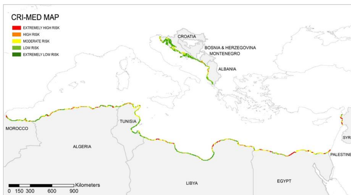
Figure 3: Mediterranean coastal risk map

The national “coastal hot-spots” that were identified through this study are: