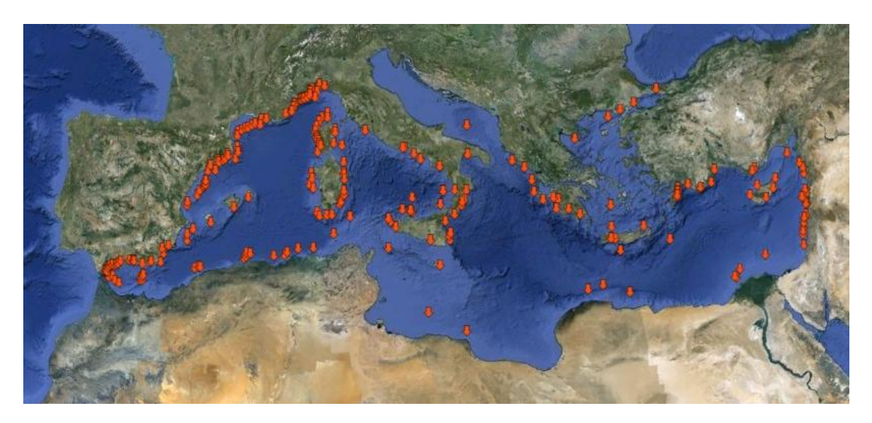
Figure 1: Distribution of main canyons identified in the Mediterranean (after authors of Document & [3], [6]). Map: Google earth©