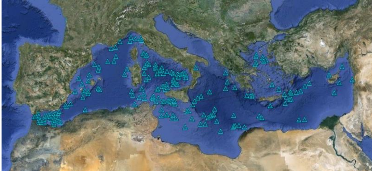
Figure 4 : Distribution of the main Mediterranean seamounts (Source: Esri, DigitalGlobe, GeoEye, icubed, USDA, USGS, AEX, Getmapping, Aerogrid, IGN, IGP, swisstopo & the GIS User Community; map: Google earth©

At present, these seamounts are little taken into account in terms of conservation since only that of Eratosthenes (eastern basin) has since 2006 been included as a restricted fishing area by GFCM [3].