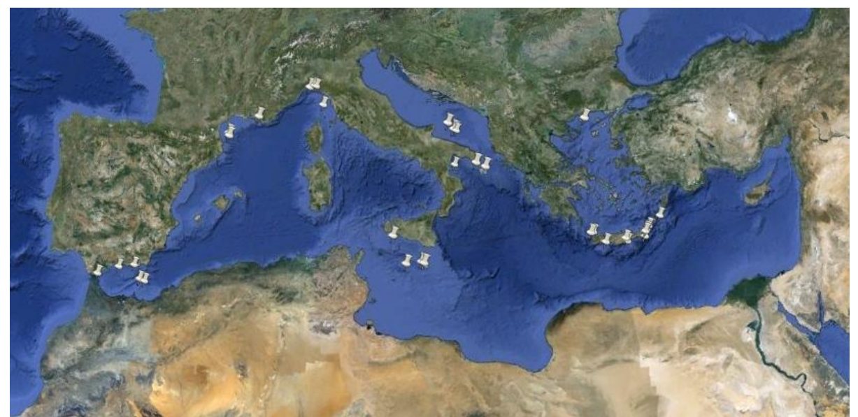
Figure 2: Location of some populations of structuring invertebrates in the Mediterranean. These are mostly 'deep water corals' (after authors of Document & [8], [9], [10]). Map: Google earth©

Their presence can thus be a necessary precondition for setting up specific measures. Although at present they are still not much taken into account in terms of conservation, since only the Santa Maria de Leuca reef with Lophelia and Madrepora has since 2006 been included as a restricted fishing area by GFCM [11], they are at the origin of the creation of MPAs (e.g. the Cassidaigne and Lacaze-Duthiers canyons, France). Similarly, two sites have been chosen to this effect by Italy (Continental slopes of the Tuscan Archipelago and Santa Maria de Leuca sector) for setting up the Natura 2000 at-sea network, and many are included in the proposal to set up a representative MPA in the Sea of Alboran [6].