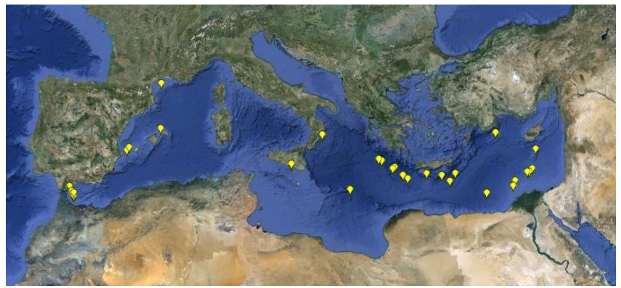
Figure 3: Locating chemo-synthetic populations that have been studied in the Mediterranean (after authors of Document & [6], [12], [13], [14], [15]).

'Cold seeps' seem to be well represented along the Mediterranean fold (eastern basin; Figure 3). 'Mud volcanoes' are frequent in the eastern basin especially at the level of the Mediterranean fold and in the south-east of the basin, but the discovery of 'pockmarks' around the Balearic Islands allows us to envisage their existence in the western basin (Acosta et al., 2001, in [12]; Figure 3). Lastly, six hyper-saline anoxic lakes have been localised at the level of the Mediterranean fold [4] (Figure 3).