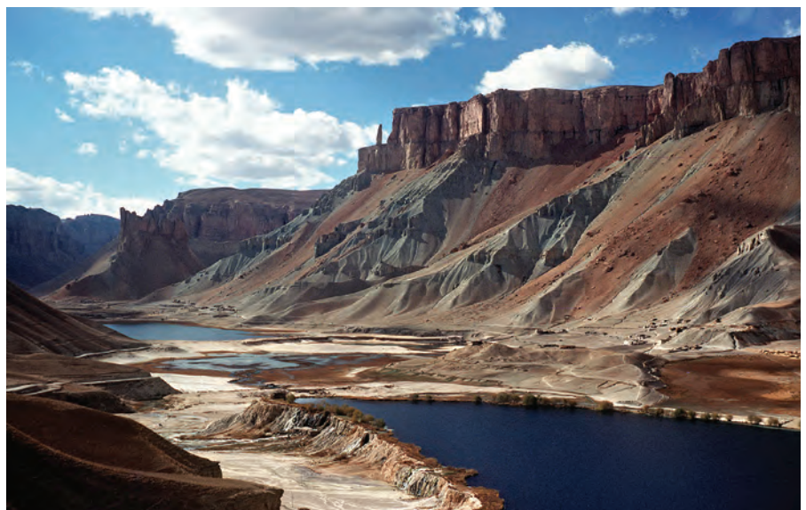
The natural beauty of Bamyan, Afghanistan. The nation is working with UNEP on ecosystem-based disaster reduction and climate action.

For more information on UNEP's work on Disasters and Conflicts, visit unep.org or follow us on Facebook or Twitter.