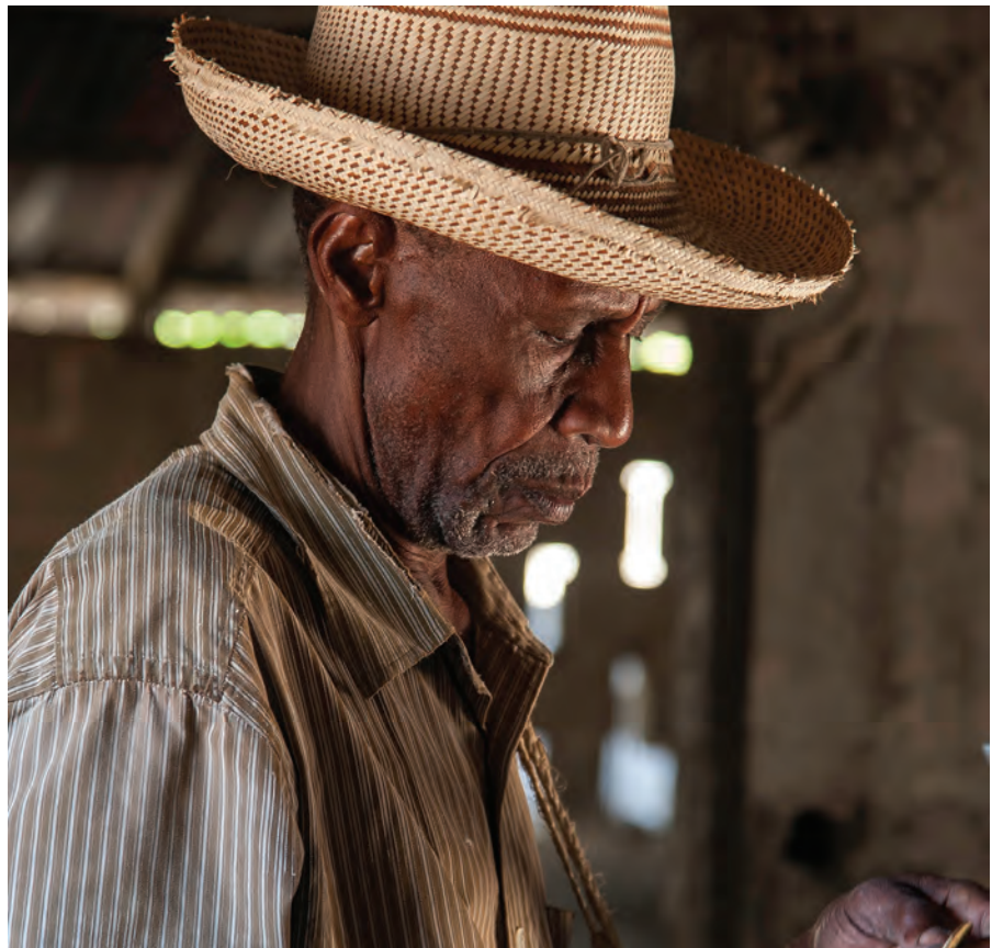
A grain miller at work in Les Anglais, Haiti, where a sustainable micro-grid is providing energy to households and small businesses – part of long-term support for recovery from the 2010 earthquake.

SUPPORTED TO REDUCE THE RISKS OF NATURAL DISASTERS, INDUSTRIAL ACCIDENTS AND CONFLICTS.