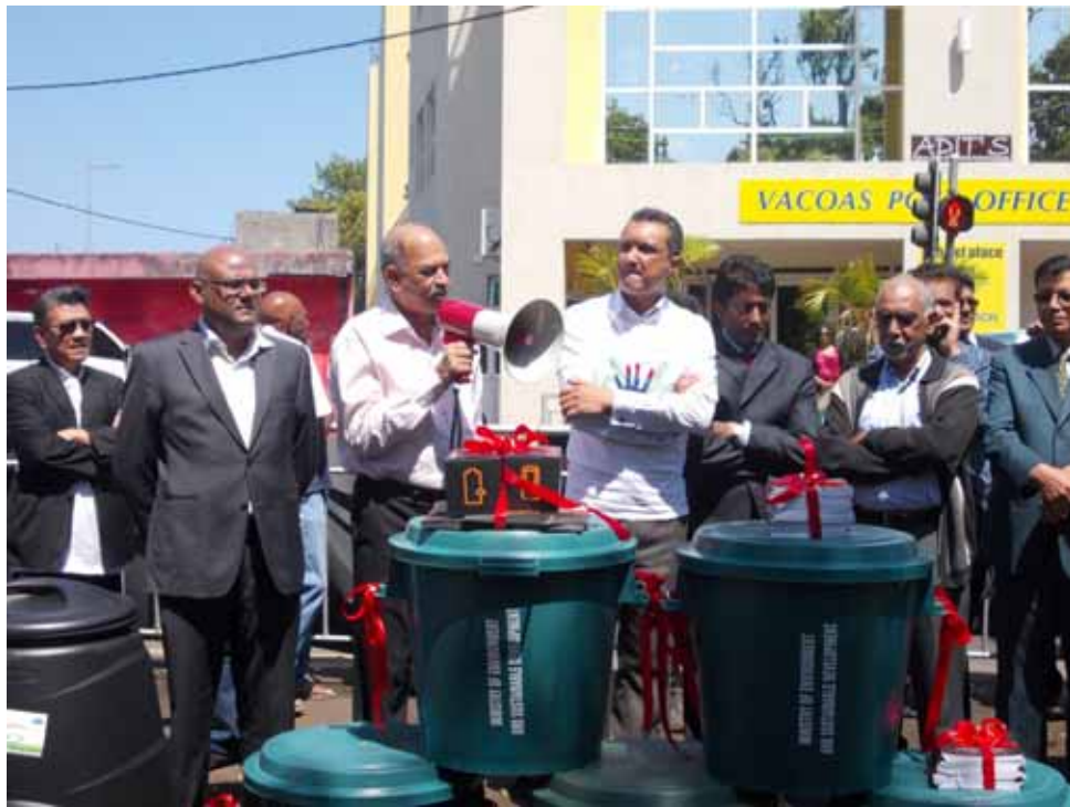
Address by Minister of Environment and SD, Hon D. Virahsawmy