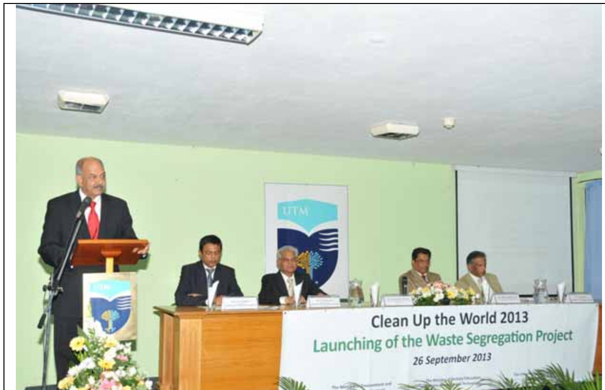
Address by Hon. D. VIRAHSAWMI, GOSK, FCCA Minister of Environment and Sustainable Development