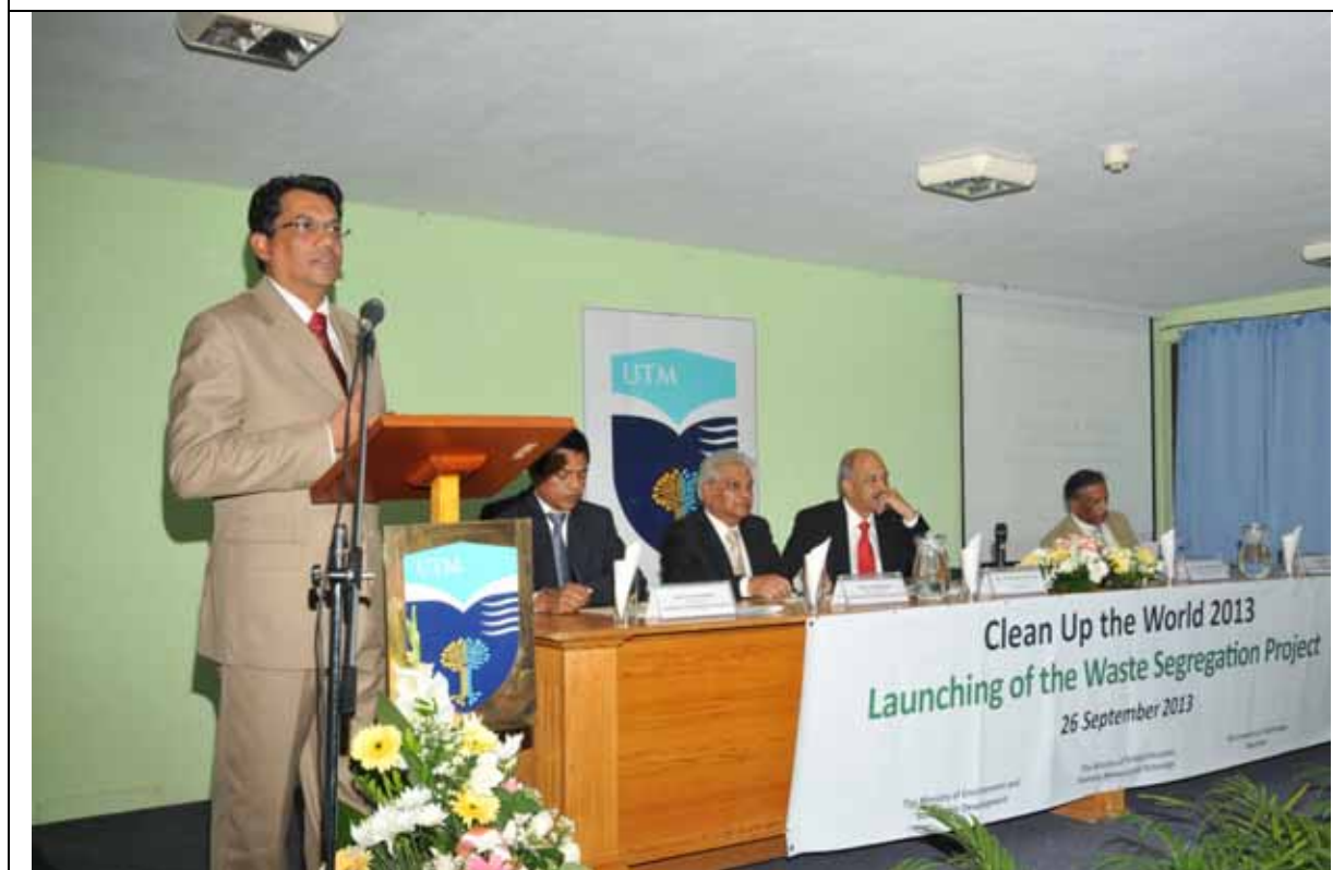
Address by Dr. the Hon. R. JEETAH Minister of Tertiary Education, Science, Research and Technology