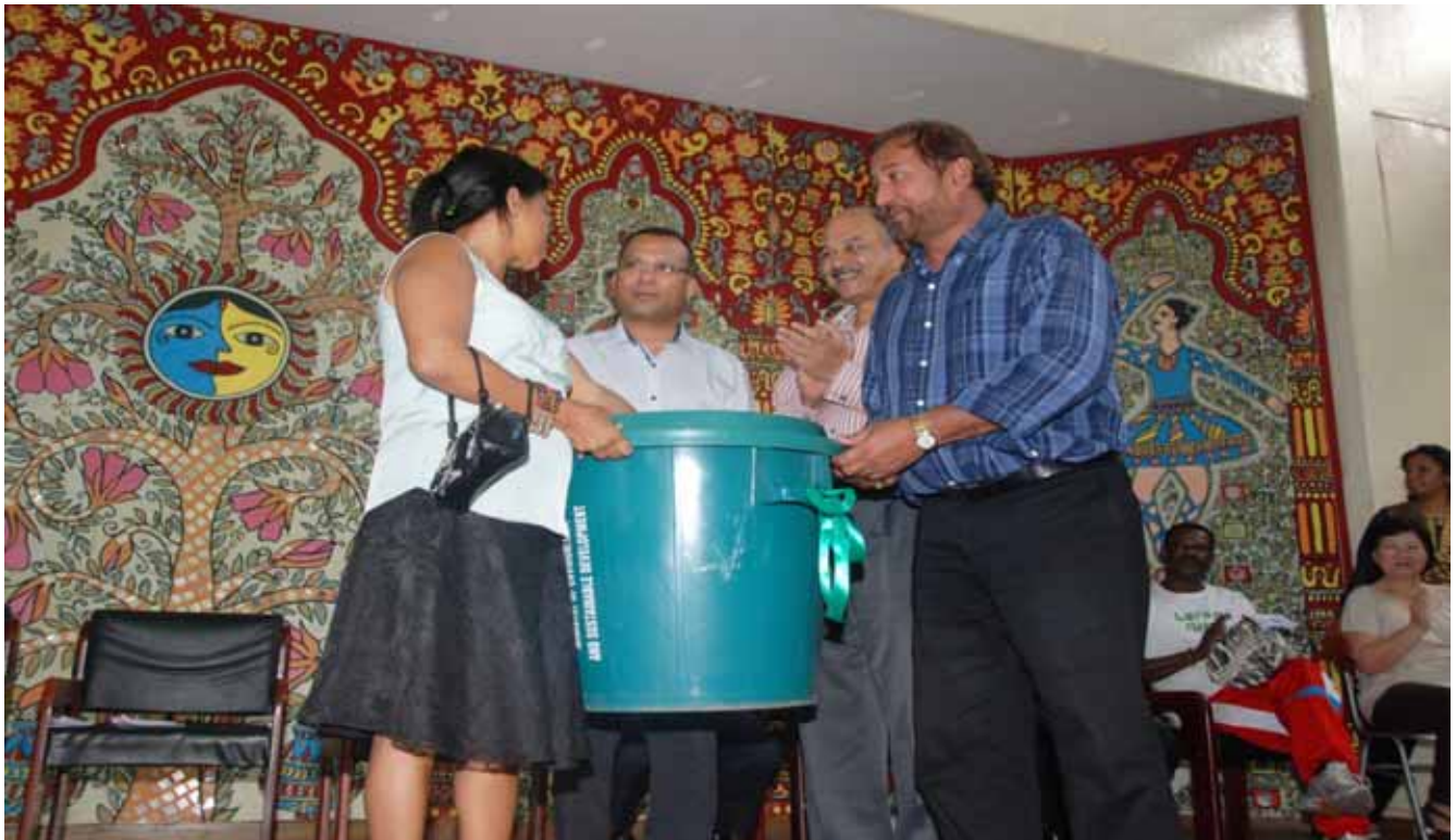
Handing over of waste bins to the school representative