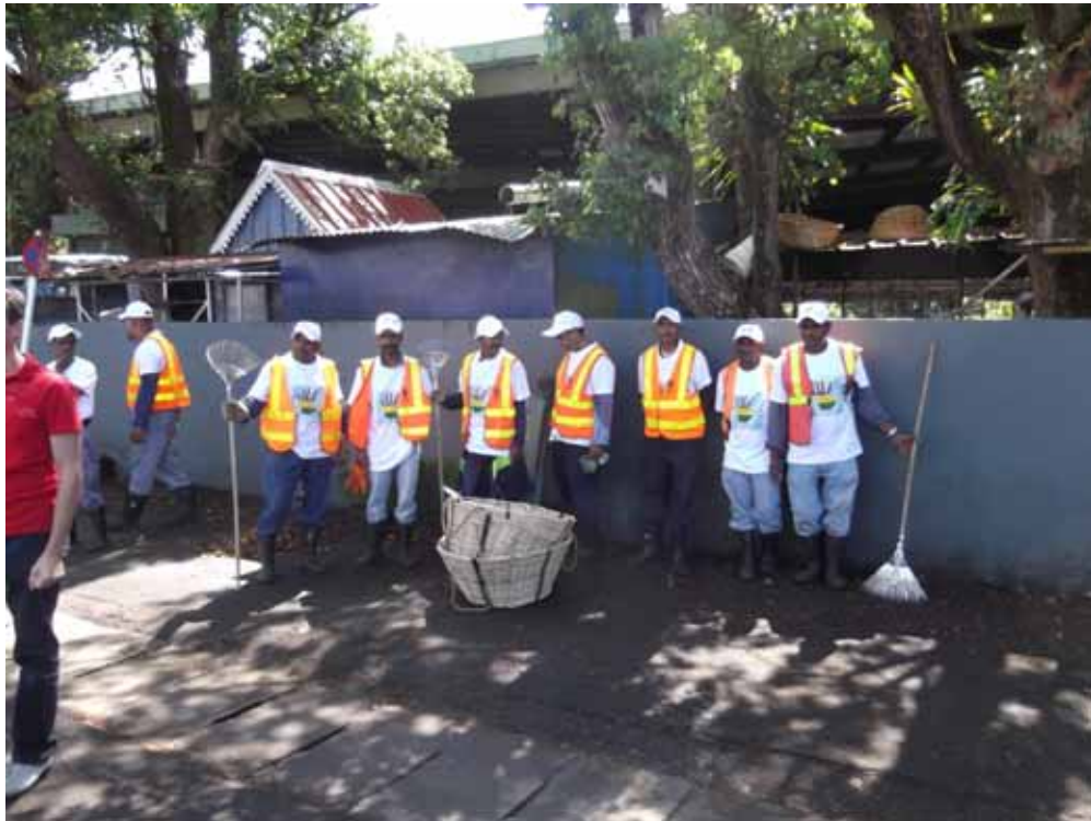
Workers from the Municipal Council of Vacoas