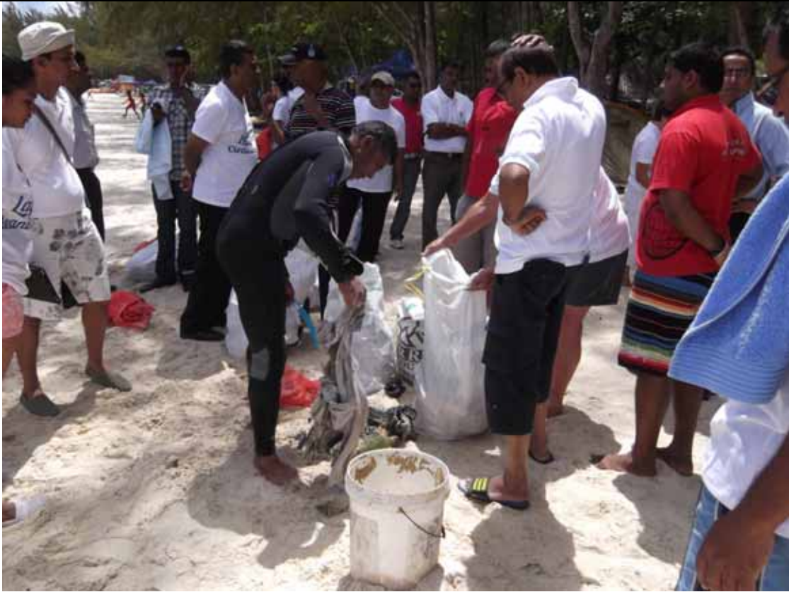
Mobilisation of volunteers for cleaning of lagoon