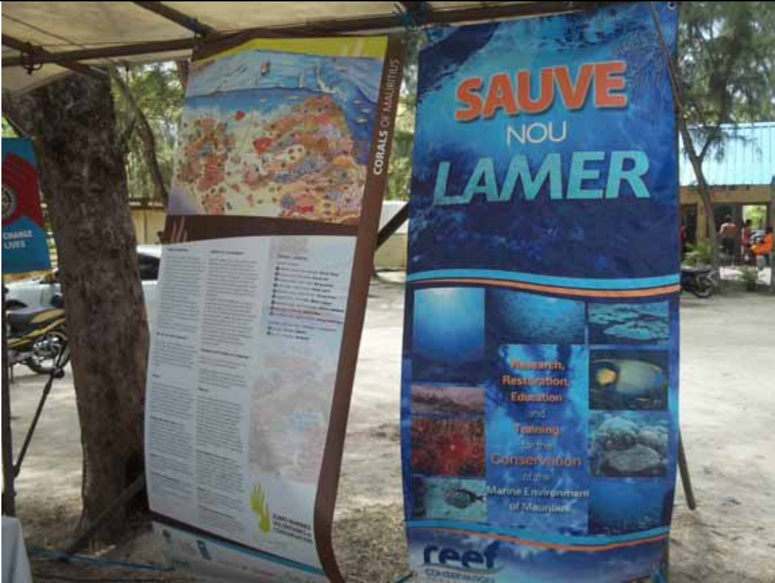
Display of banners on importance of our lagoon and sea