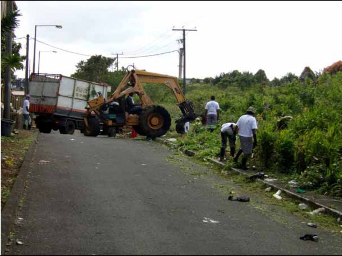
5. Municipal Council of Curepipe - Clean-up at Cite Atlee, Curepipe