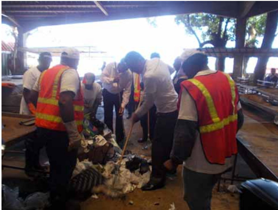
Cleaning of Vacoas Market Fair