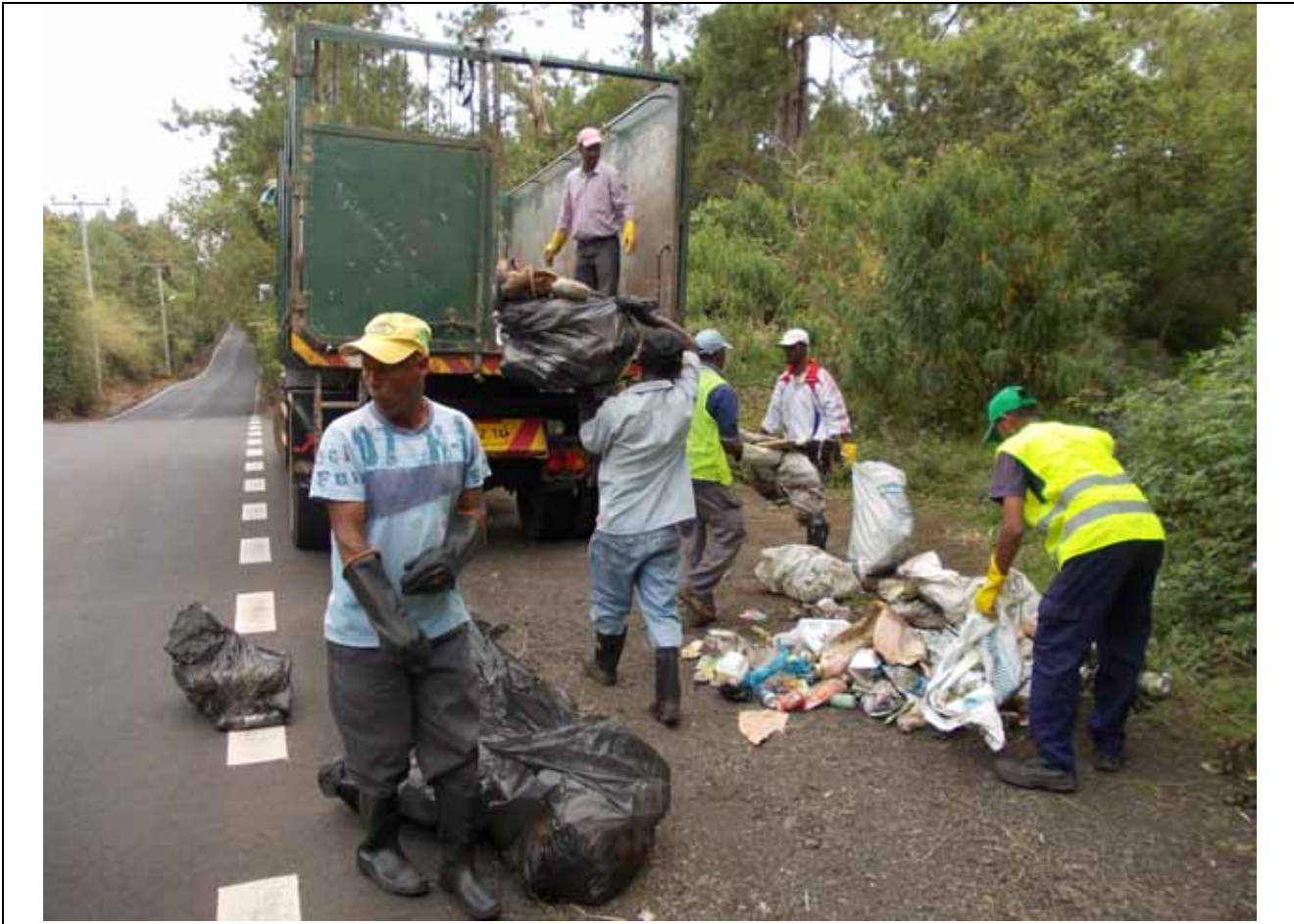
Clean Up From Petrin To Bassin Blanc