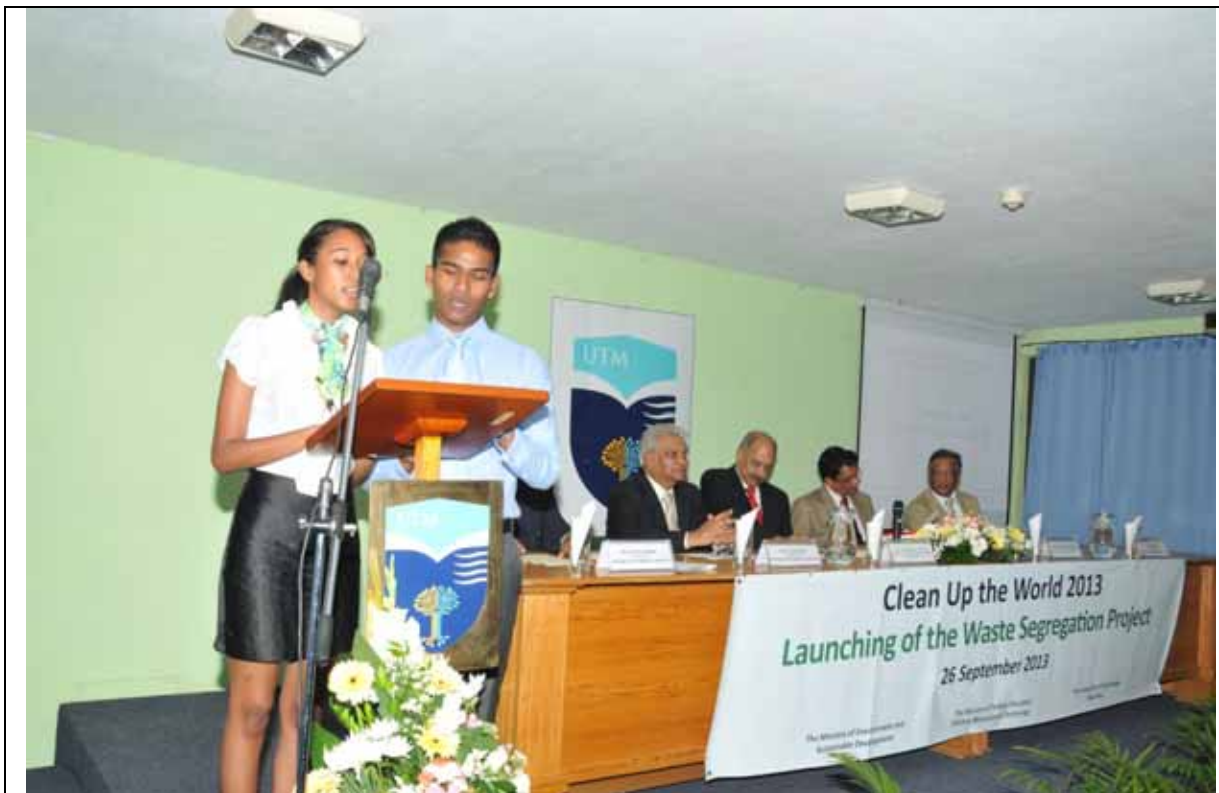
Reading of pledge on the Green Campus Charter by students of UTM and handing over of pledge to Hon. D. VIRAHSAWMI, GOSK, FCCA Minister of Environment and Sustainable Development and to Dr. the Hon. R. JEETAH Minister of Tertiary Education, Science, Research and Technology