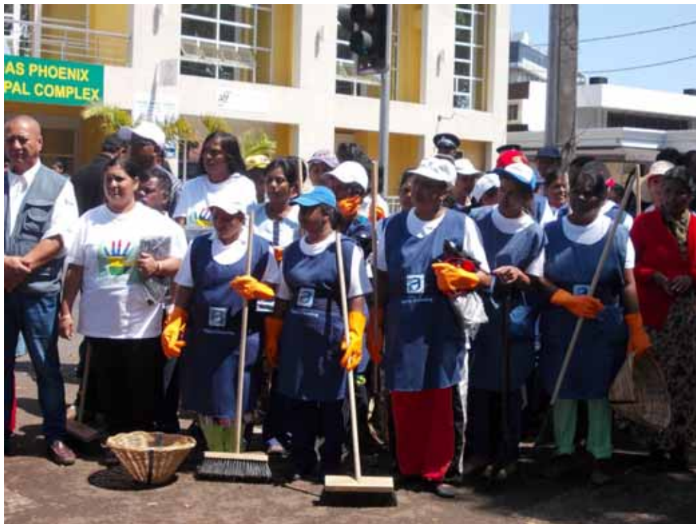
Workers from Alpha Cleaning Ltd participating in the Cleaning activity