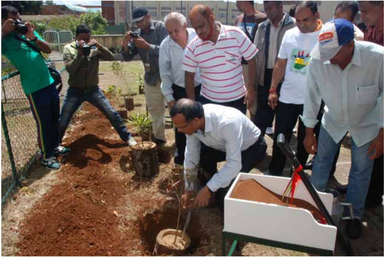
Tree planting by Hon. S. Faugoo, Minister of Agro-Industry & FS