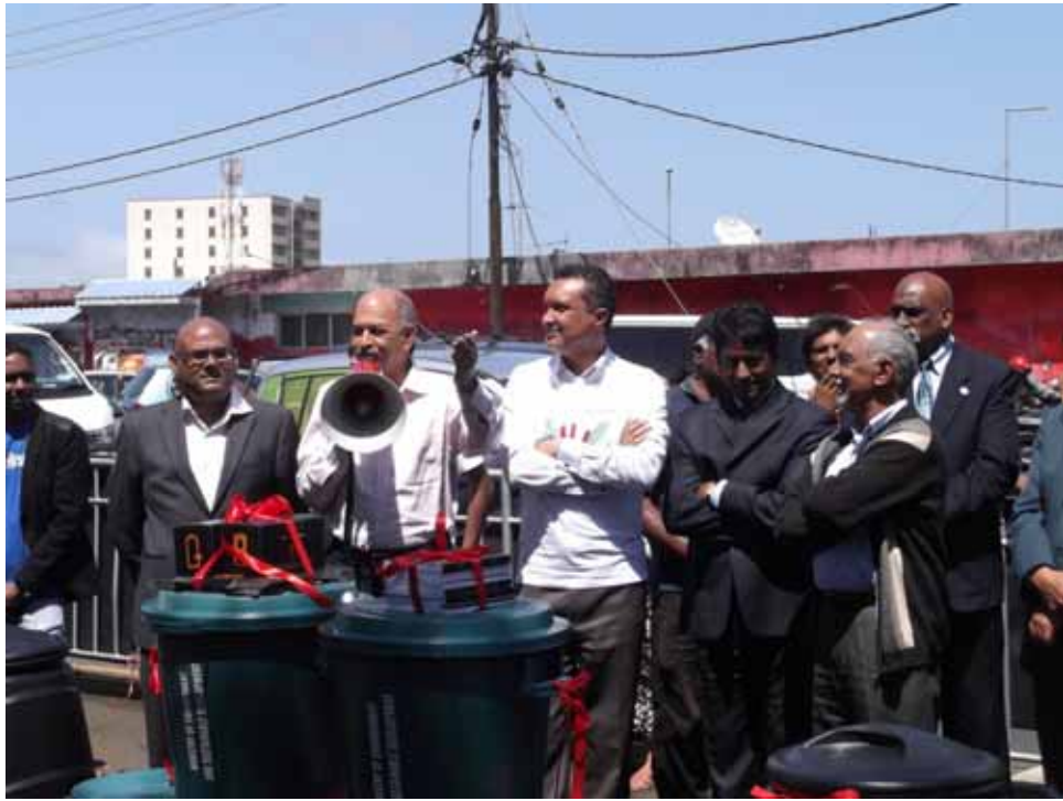
Address by Minister of Environment and SD, Hon D. Virahsawmy