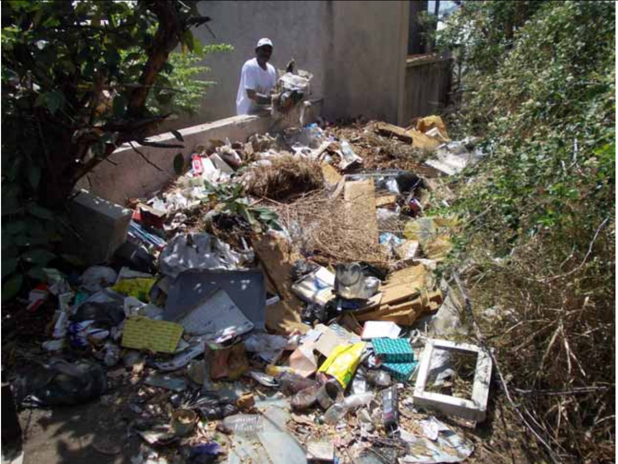
Municipal Council of Port-Louis - Clean Up at Camp Benoit, Port Louis