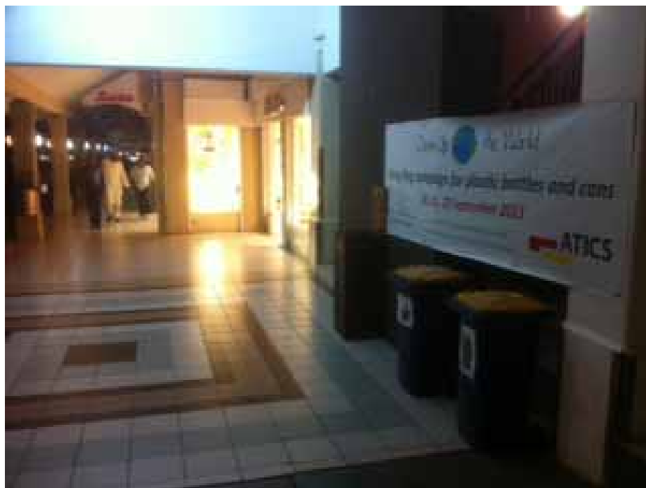
Waste Segregation at Trianon Shopping Park, Trianon