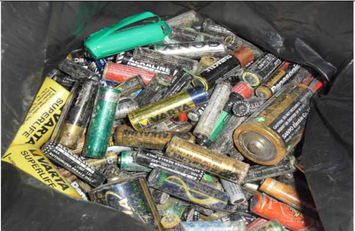
Collected of used batteries at VIP Commercial Centre, Flacq