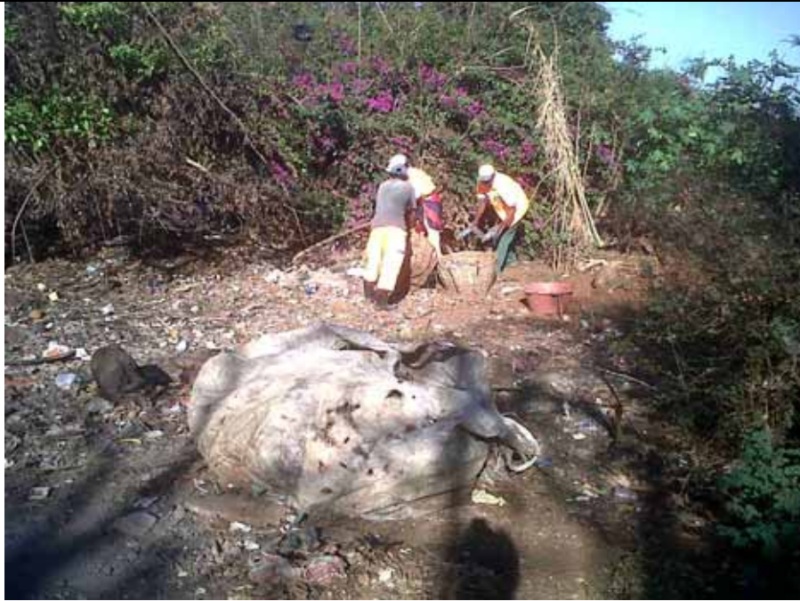
9. The District Council of Black River - Clean up at Bambous, Black River