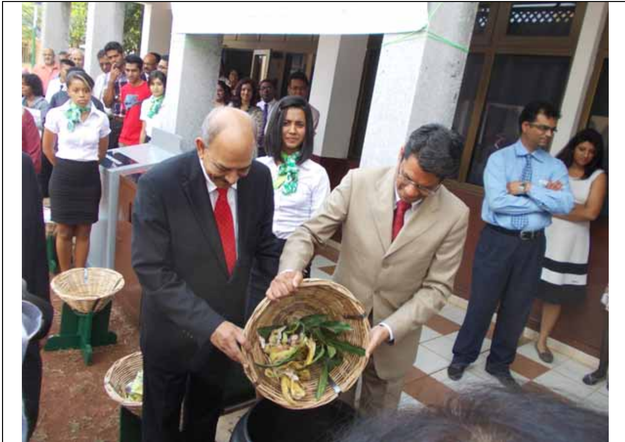
Disposal of organic wastes in the composting unit by Hon. D. VIRAHSAWMY, GOSK, FCCA Minister of Environment and Sustainable Development and Dr. the Hon. R. JEETAH Minister of Tertiary Education, Science, Research and Technology