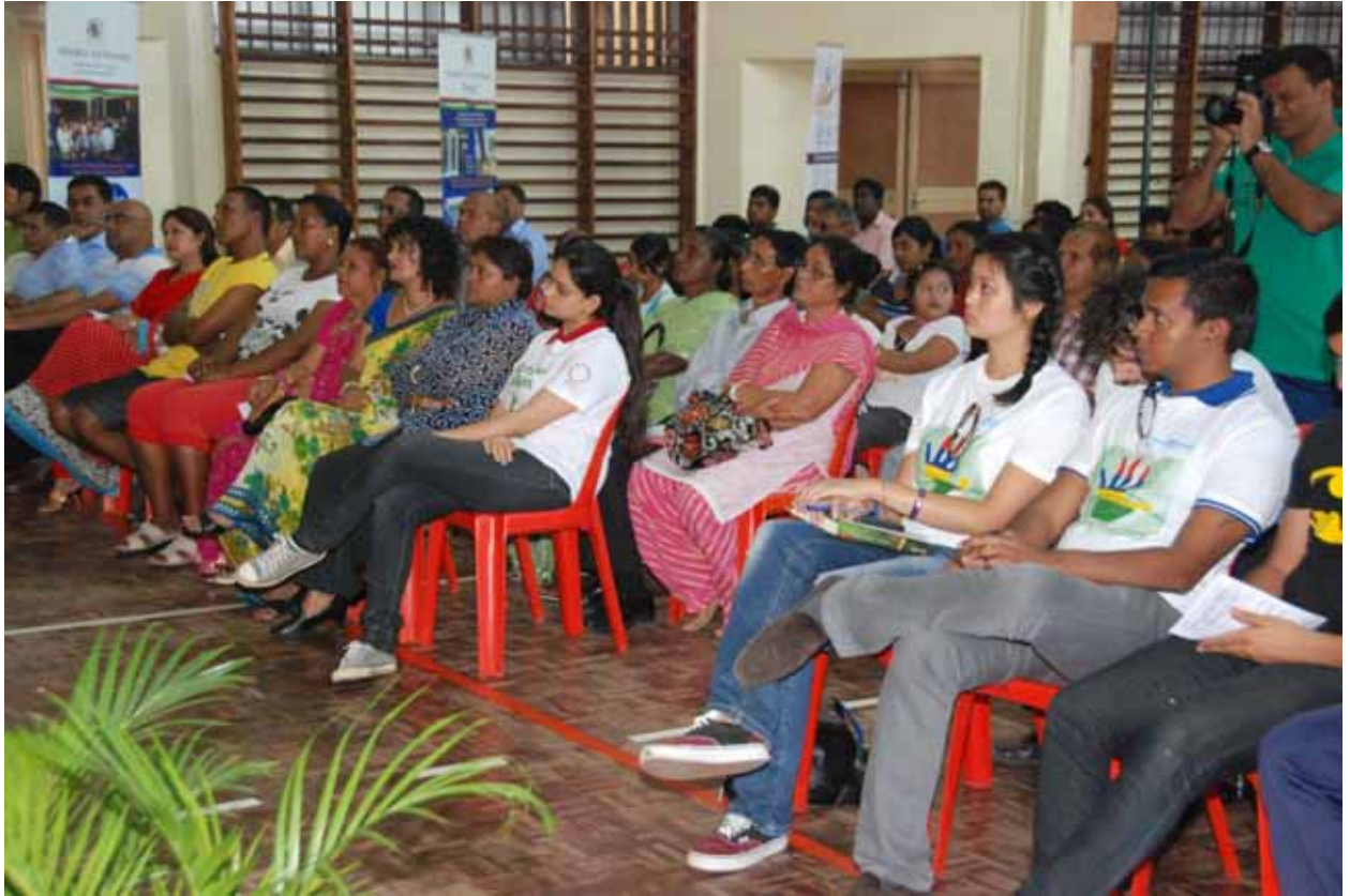
Audience in the Hall