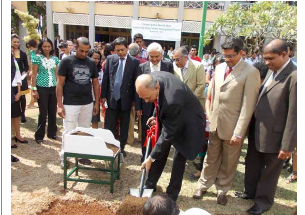
Tree planting by Hon. D. VIRAHSAWMY, GOSK, FCCA Minister of Environment and Sustainable Development