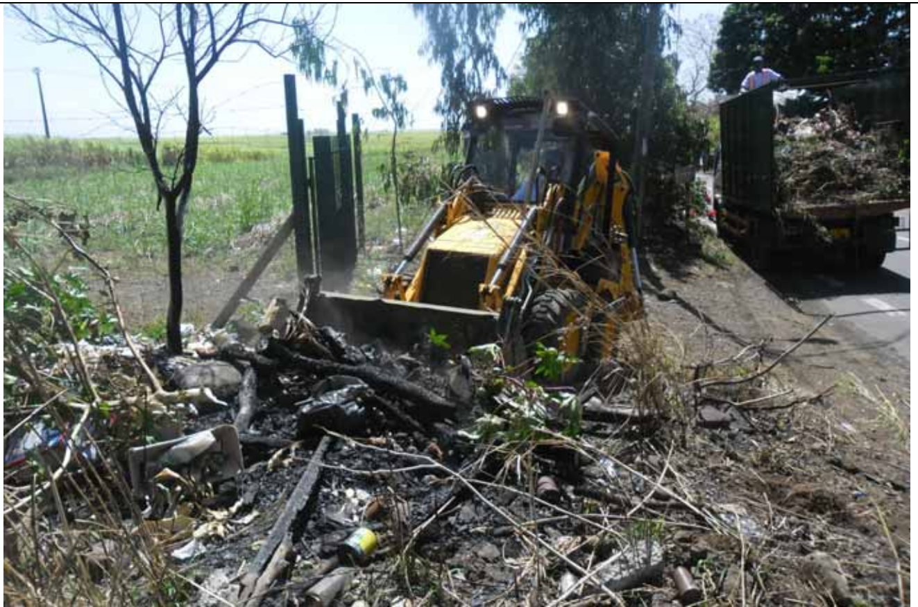
11. The District Council of Riviere du Rempart – cleanup at Poudre D'Or