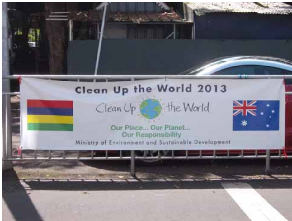
Cleaning activity at the Vacoas market place