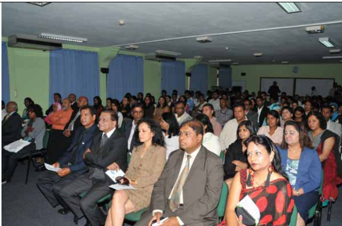
Audience in the conference room of UTM