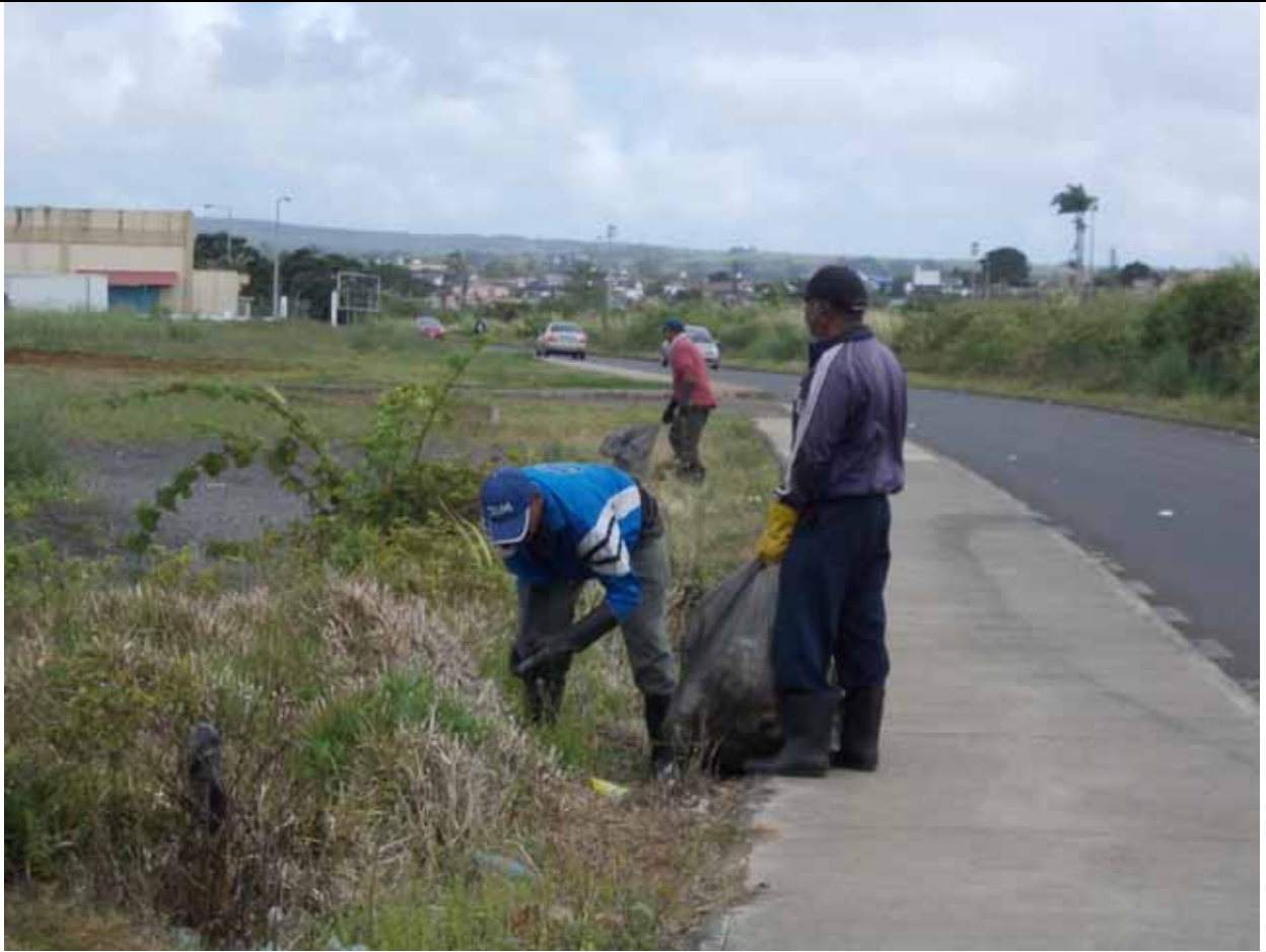
Clean Up at Rose-Belle Health track, Grand Port