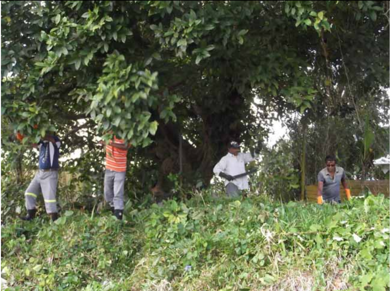
8. The District Council of Moka - Clean up at Quartier Militaire, Moka