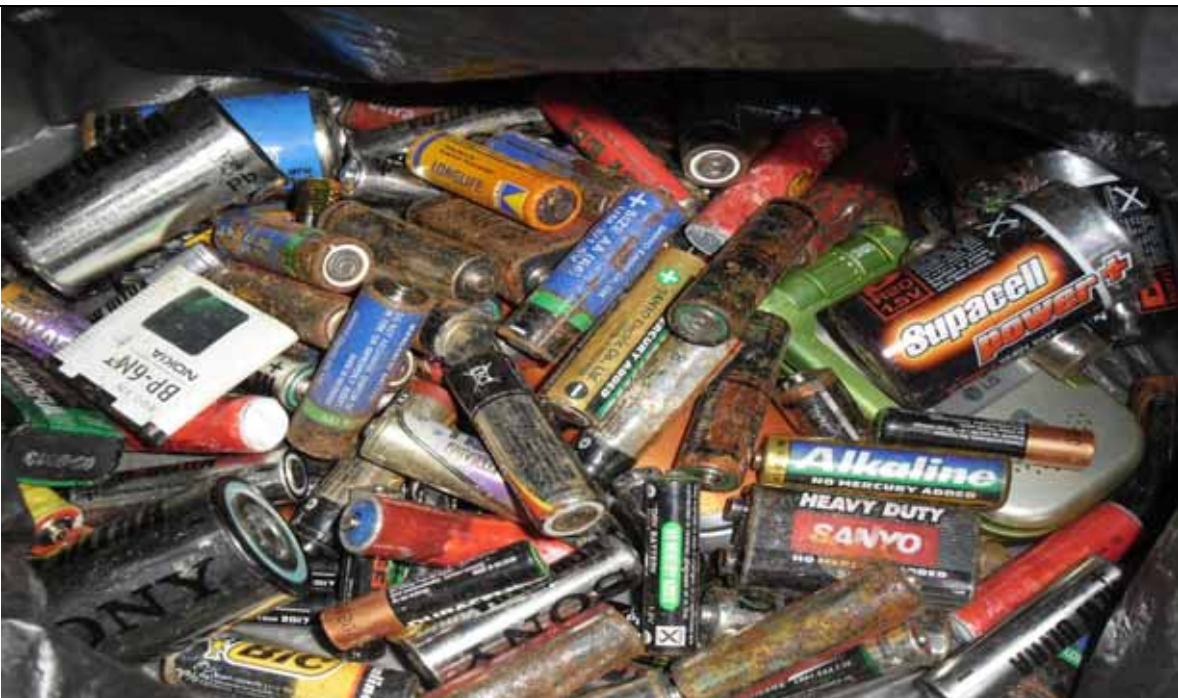
Collected of used batteries at Trianon Shopping Park, Trianon