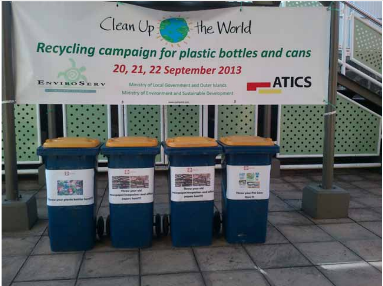
Waste Segregation at VIP Commercial Centre, Flacq