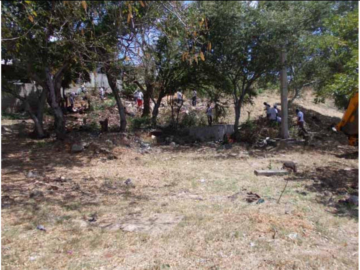
2. Municipal Council of Port-Louis - Clean Up at Montee S, Port Louis