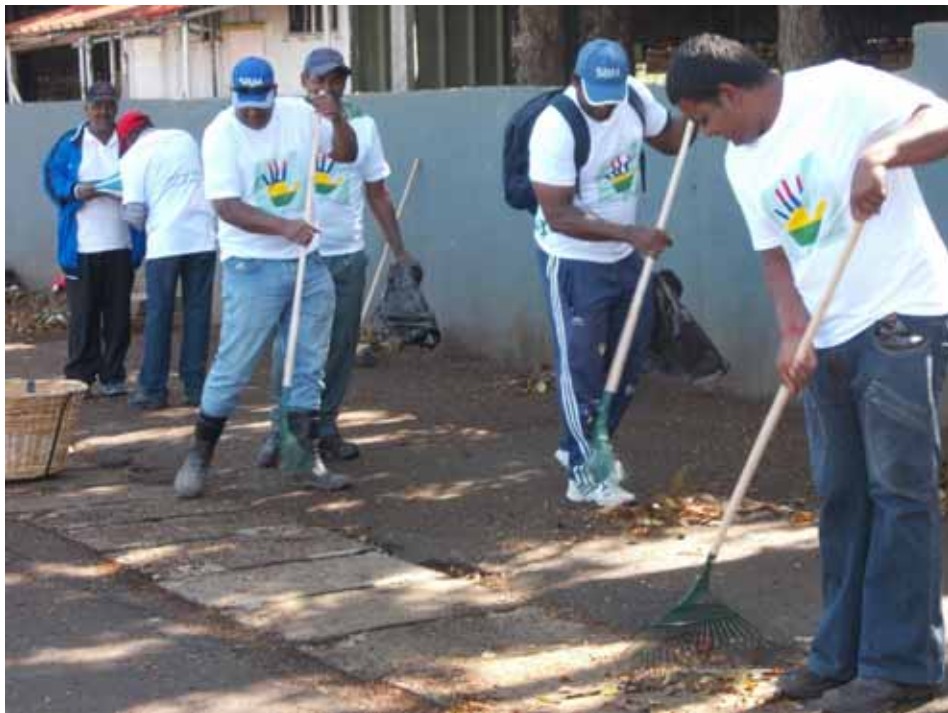
Cleaning of Vacoas Market place by workers of the Ministry of Environment and SD