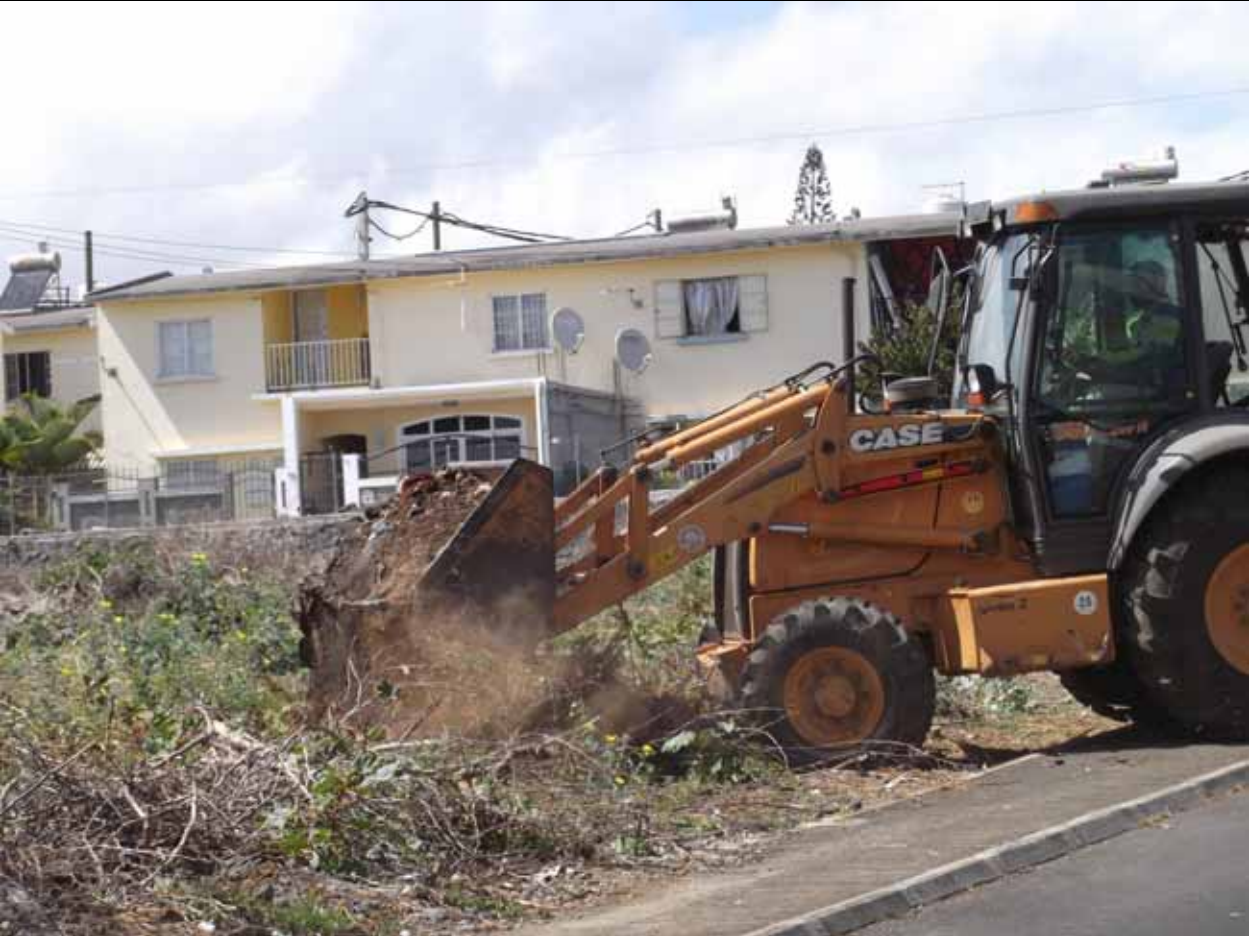
up at Camp Le Vieux, Rose Hill