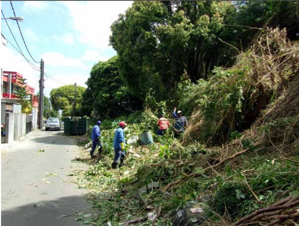
1. Municipal Council of Vacoas / Phoenix: Clean-up at Sadally Rd, Vacoas