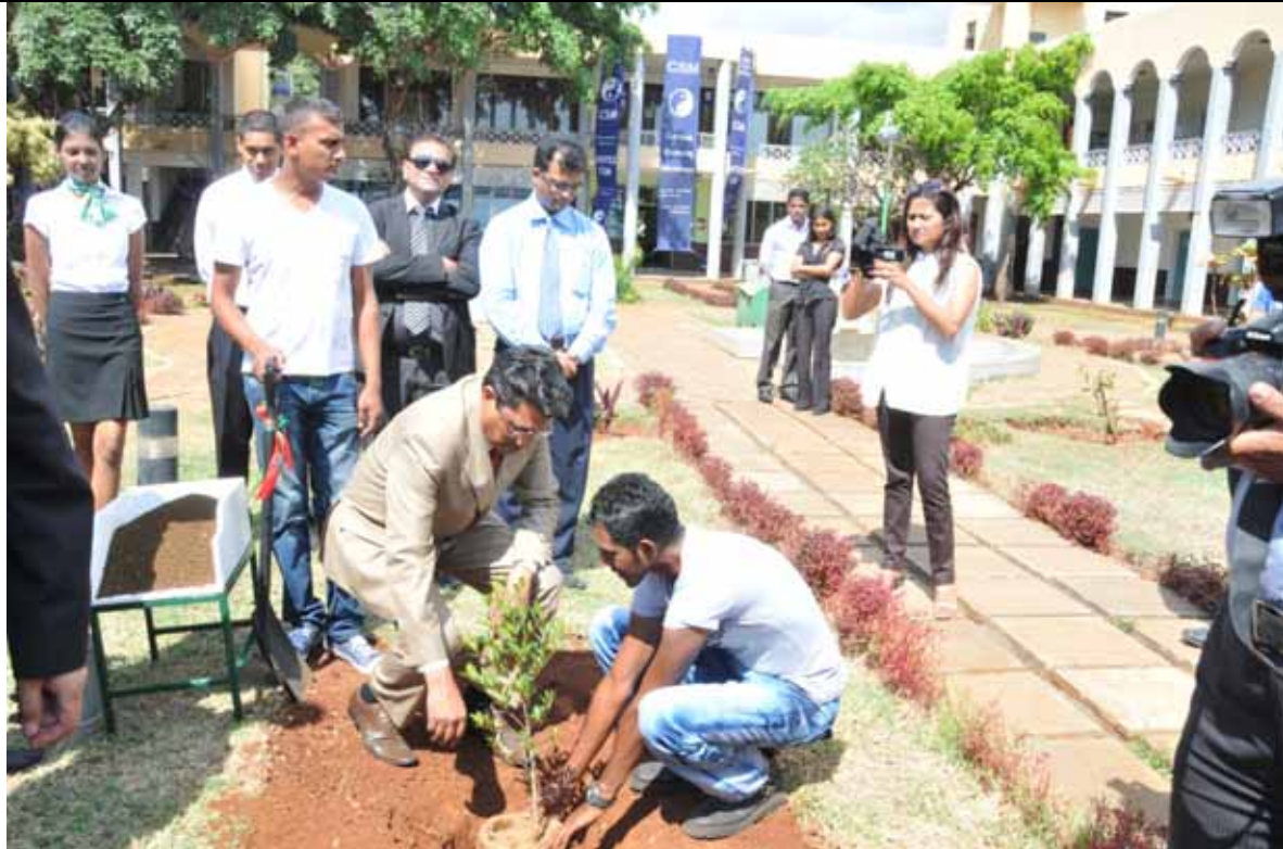
Tree planting by Dr. the Hon. R. JEETAH Minister of Tertiary Education, Science, Research and Technology