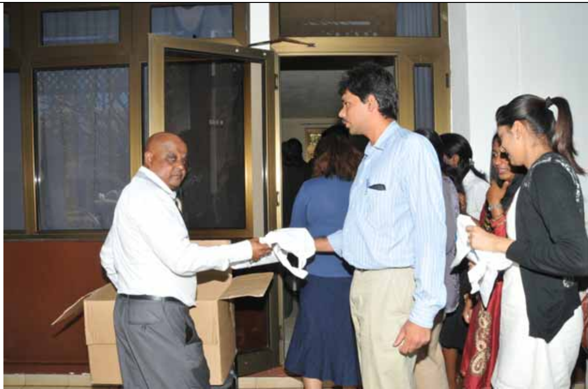
Distribution of cloth bags and resource materials