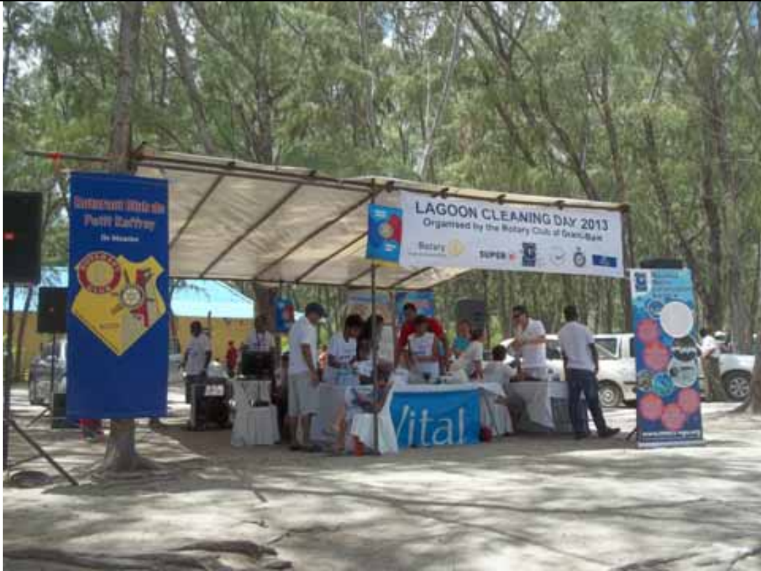
Registration of divers participating at the event