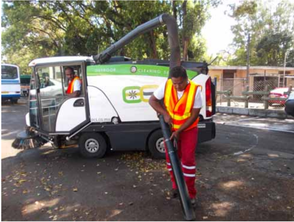
Road sweeper provided by the Outdoor Cleaning Services in action