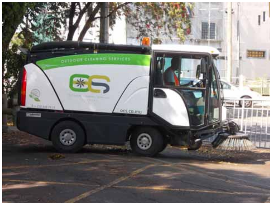
Road sweeper provided by the Outdoor Cleaning Services for the cleaning activity