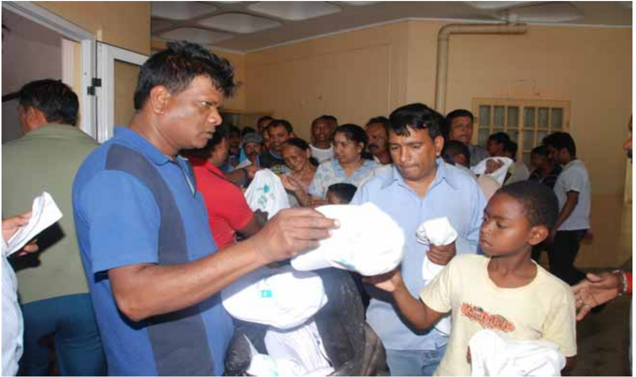
Distribution of T-shirts and caps