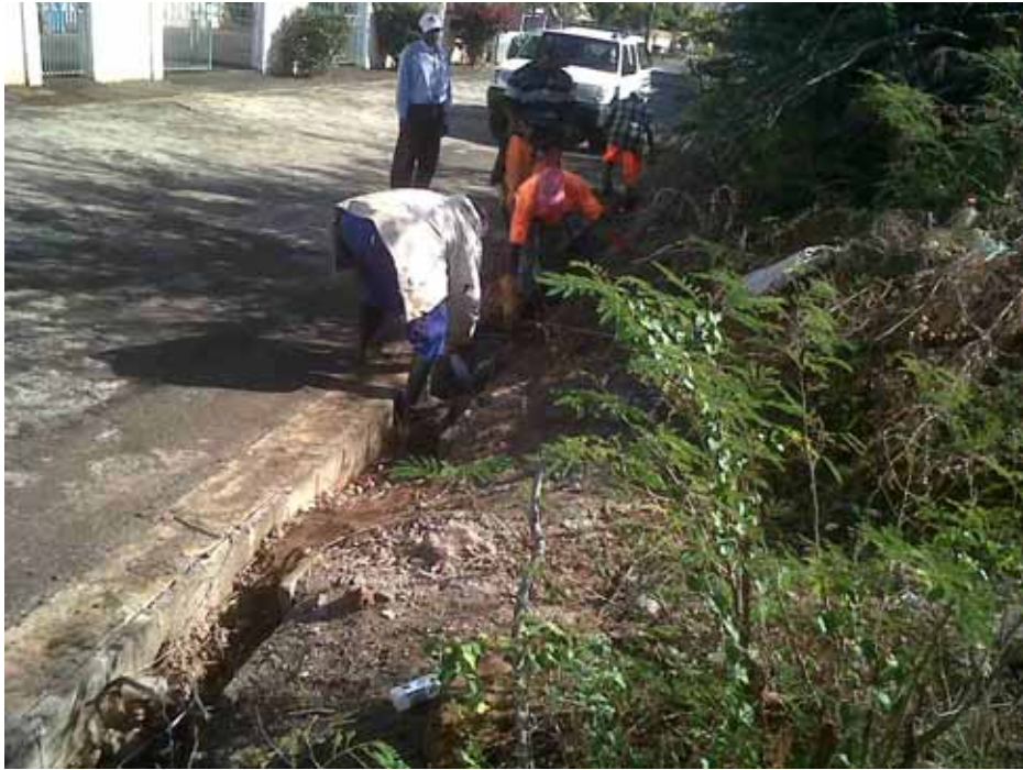
Clean up at Flic en Flac, Black River