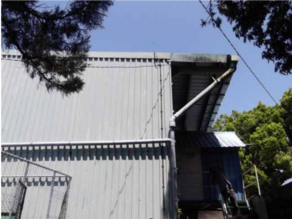
Rainwater Harvesting System which has been set up by the Municipal Council of Vacoas/Phoenix at the Market place