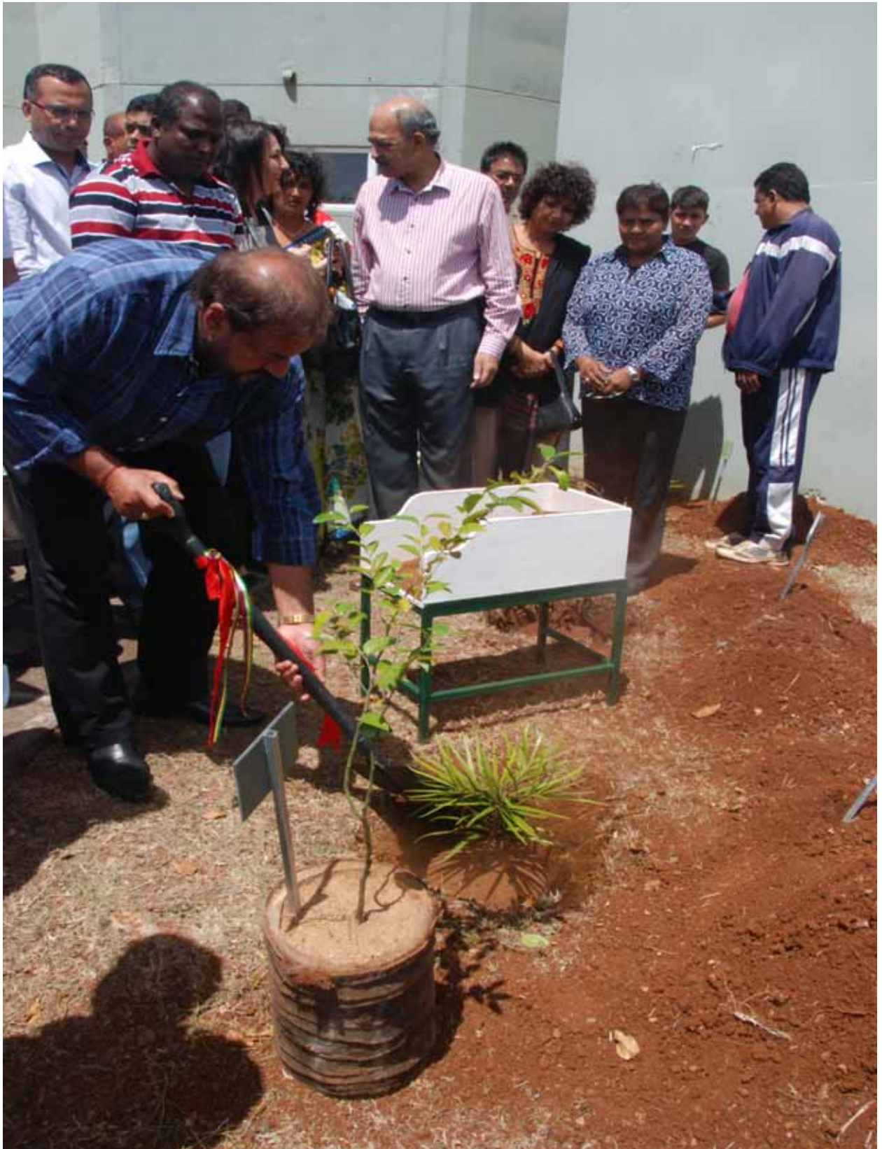
Tree planting by Hon. D.Rittoo Minister of Youth and Sports