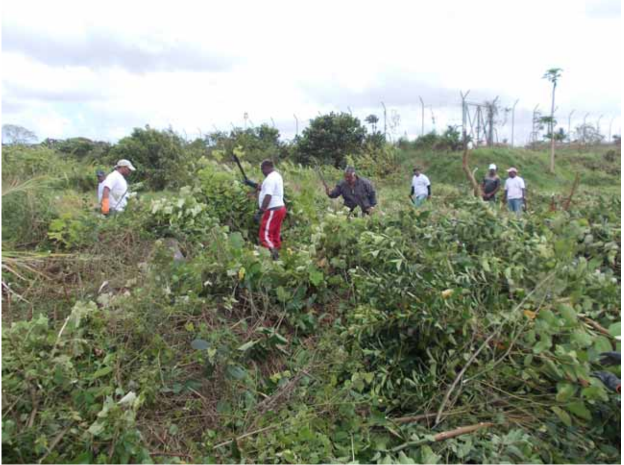
7. The District Council of Savanne - Clean Up at S.I.T, Savanne