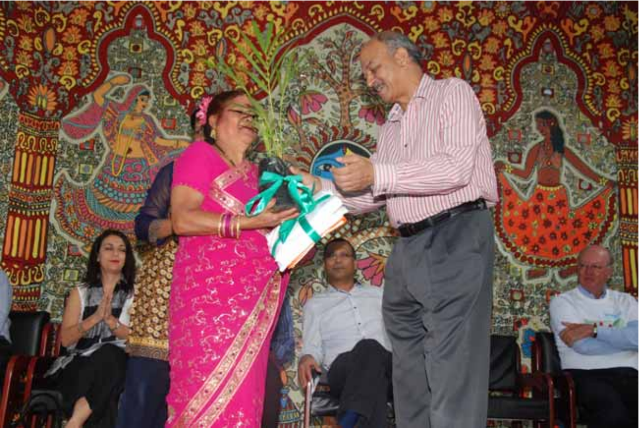
Symbolic handing over of bag, T-shirt, cap and plant by Hon. D. VIRAHSAWMY Minister of Environment & SD