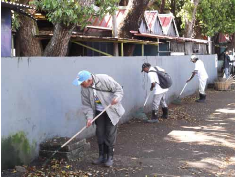
Cleaning of the Vacoas Market place by workers of the Ministry of Environment & SD