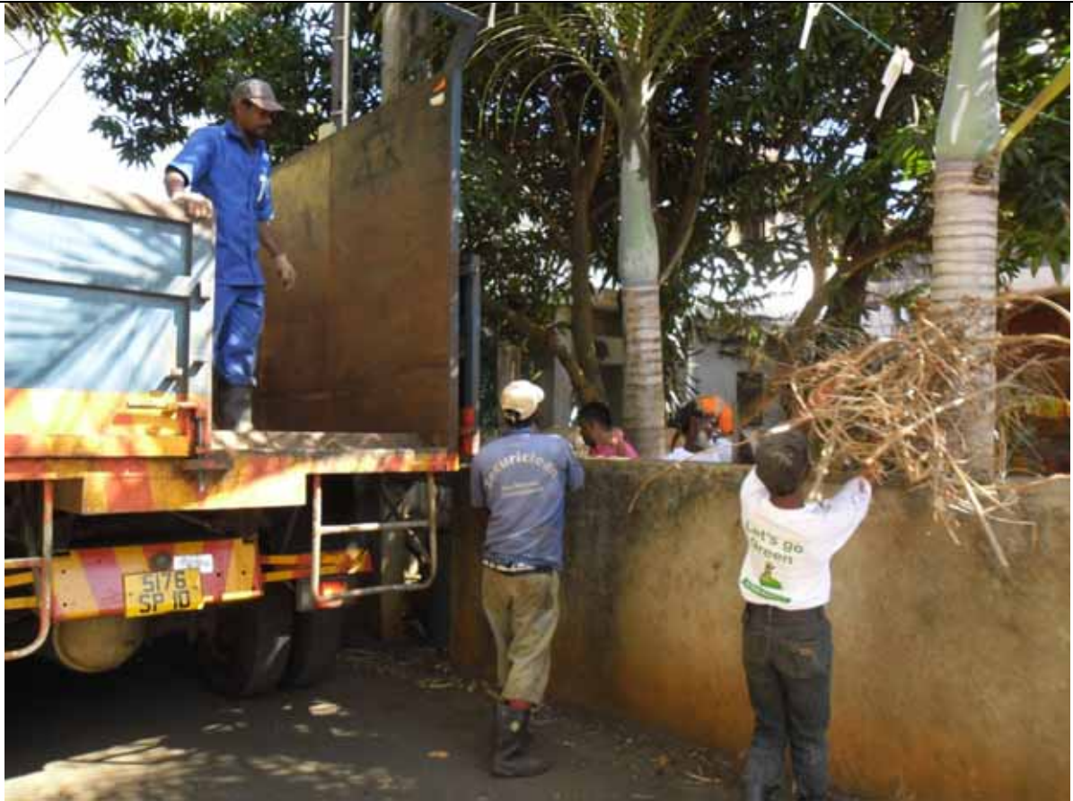
12. The District Council of Pamplemousses – Cleanup at Triolet