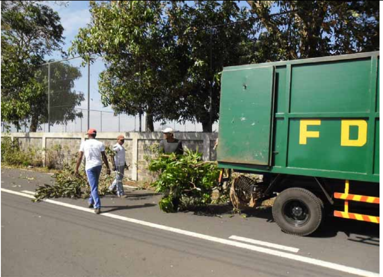
10. The District Council of Moka - Clean Up at Camp Ithier, Flacq