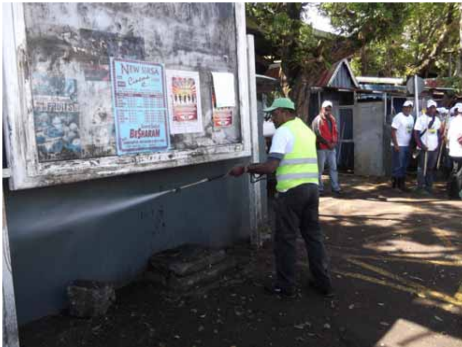
Cleaning with high water pressure by workers of OCS