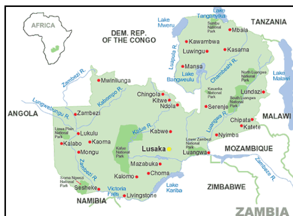
Figure 2.1: Location of Zambia in the Southern Africa Region

The main rivers in Zambia are the Zambezi, Kafue, Luangwa and Luapula and the major lakes are Tanganyika, Mweru, Bangweulu and Kariba. The northern part of the country receives the highest rainfall with an annual range of 1,100mm to over 1,400mm. The southern and eastern parts of the country have less rainfall, ranging from 600mm to 1,100mm annually.