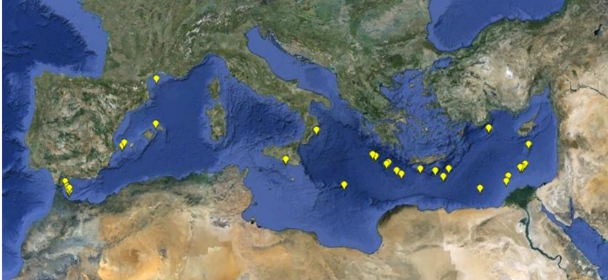
Figure 3: Locating chemo-synthetic populations that have been studied in the Mediterranean (after authors of Document & [6], [12], [13], [14], [15]). Map: Google earth©

'Cold seeps' seem to be well represented along the Mediterranean fold (eastern basin; Figure 3). 'Mud volcanoes' are frequent in the eastern basin especially at the level of the Mediterranean fold and in the south-east of the basin, but the discovery of 'pockmarks' around the Balearic Islands allows us to envisage their existence in the western basin (Acosta et al., 2001, in [12]; Figure 3). Lastly, six hyper-saline anoxic lakes have been localised at the level of the Mediterranean fold [4] (Figure 3).