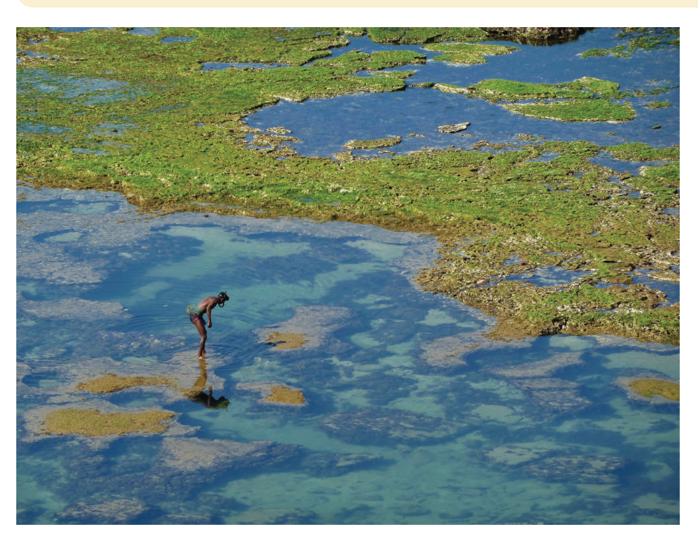
Figure 23.2. Fisherman scouring intertidal reef in southern Madagascar.

Agalega. Fisheries provide employment to about 12 000 people (full-time fishers and employees in processing, for example freezing, salting, smoking, canning and ancillary services). There are about 4 000 artisanal fishers using >2 000 boats, and 700 industrial fishers using 15 boats. Recreational fishing lands a low volume of fish, compared to the other sectors, but 24 000 fishers using >1 000 boats was reported by Jehangeer (2006). Production is insufficient to cover local demand for fish products.