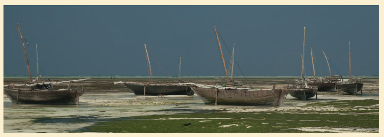
Fishing boats waiting for the tide in northern Zanzibar, Tanzania.

From time immemorial, migrant fishers along the coast of East Africa have followed fish movements, to increase catches and income. These fishers often cross geopolitical borders, and their movements are highly variable, the duration ranging from a few days to several years. Migrations are seasonal, mostly in synchrony with the milder sea conditions of the North East Monsoon, when sea travel in wooden boats is easier. Fisher migrations can be seen as a social adaptation to a complex environment of fluctuating resource availability. Migrations have social and economic implications for both home and host destinations. Most migrants are young men, leaving behind wives and children. They tend to increase host