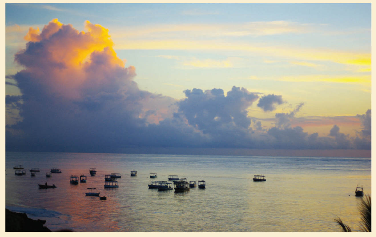
Boats in Malindi at sunrise.

An artisanal fishery has been active in Malindi Ungwana Bay for hundreds of years, and presently comprises about 3 500 fishers and 600 traditional boats that fish in nearshore waters. These fishers compete for finfish and prawn catches with a commercial trawl fishery, active since the 1970s. Trawling takes place close to the coast (within 5 nautical miles, in contravention of the fisheries act) because most prawns occur in shallow waters near river mouths. This brings them into direct conflict with artisanal fishers, when trawling damages artisanal fishing gears, or when retained fish bycatch competes with artisanal catches on local markets. The artisanal fishery targets some of the finfish species caught and dis-