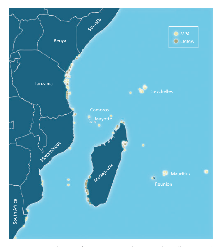
Figure 6.2. Distribution of Marine Protected Areas and Locally Managed Marine Areas in the Western Indian Ocean (from Rocliffe and others, 2014).

At the regional level, a Coral Reef Task Force has the role of coordinating work under the Nairobi Convention,