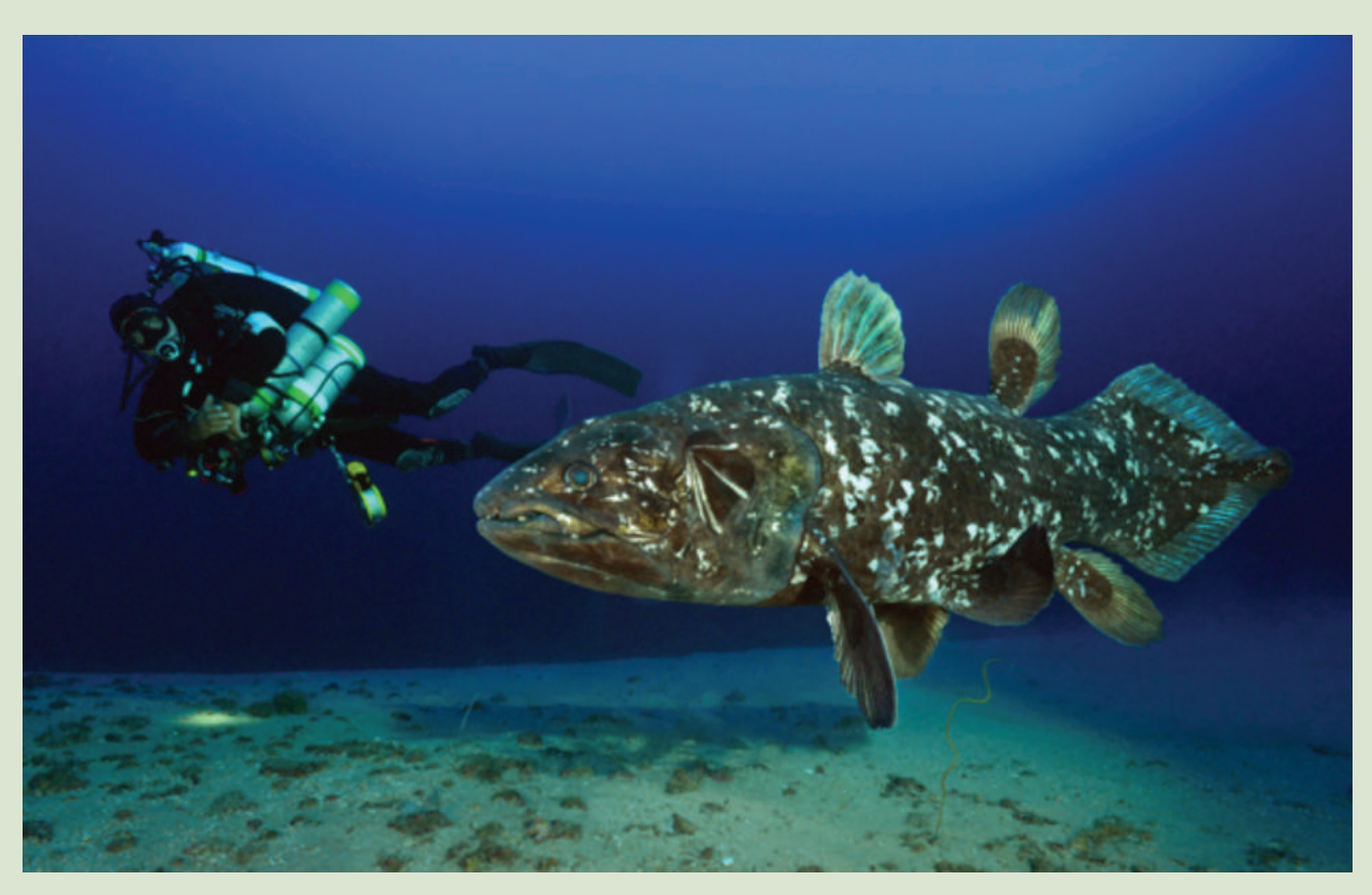
A coelacanth and technical diver in the iSimangaliso Wetland Park, South Africa.

Coelacanths ( Latimeria chalumnae ) are unique fish that surprised the world when discovered alive in 1938 after they were thought to have become extinct along with the dinosaurs. Coelacanths belong to a special division of bony fish (Subclass Sarcopterygii), characterised by their unique lobed fins that are considered to be the origins of fleshy limbs in vertebrates. They have a hollow fluid-filled notochord rather than the hard spine of other fish or the cartilaginous backbone of sharks. They also have a distinct tail with a small epicaudal fin at its tip. Coelacanths live for up to 60 years, give birth to as many as 26 live young, and can attain 2 m in length (or 70 kg) with females growing larger than males. Apart from the WIO species, Latimeria chalumnae , a more restricted species is found in Indonesia, L. menadoensis .