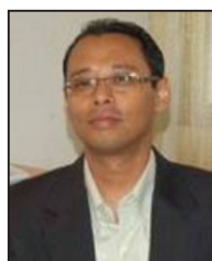
Mahesh Pradhan Chief, Environmental Education & Training Unit, UNEP

RSVP – to confirm participation, please contact: