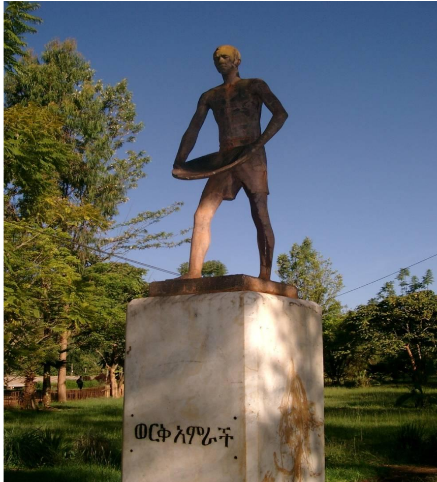
Statue of Gold panner In Oromiya regional state Shakiso Administrative , Ethiopia