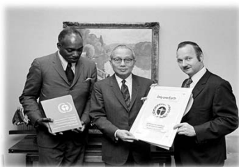
Presentation of Stockholm Conference Poster to Secretary-General U Thant (1971)

Established in 1972 at the UN Conference on the Human Environment to promote international environmental cooperation, provide policy guidance and to keep the world environmental situation under review.