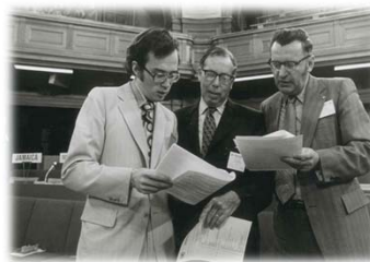
Delegates discussing a document at the Conference (1972)