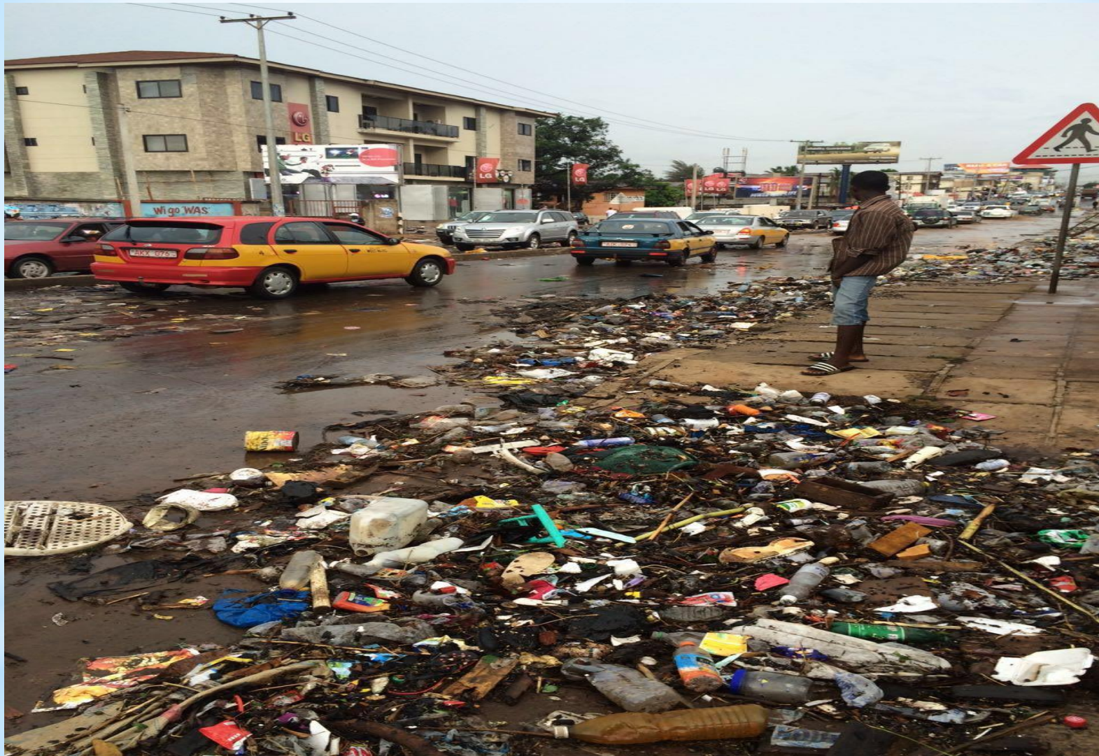
Streets of Freetown with all kinds of waste