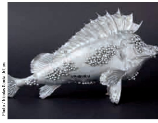
Sculpture "Pez-Peste", by Nicolás García Uriburu