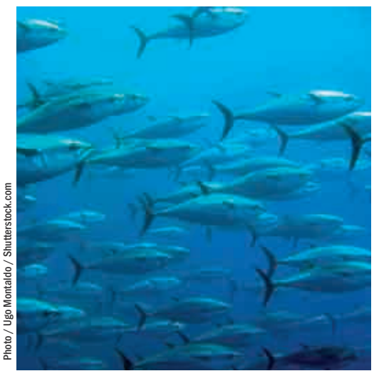
Marine food-webs are an important route of human dietary exposure to mercury

UNEP has updated the 2008 report "Global Atmospheric Mercury Assessment: Source, Emissions and Transport" in close cooperation with the Arctic Monitoring and Assessment Programme (AMAP) Secretariat. The updated report (entitled "Global Mercury Assessment 2013 - Sources, Emissions, Releases and Environmental Transport" (prepared for GC27, but will be available for INC5), provides the most recent information on atmospheric mercury emissions, releases to the aquatic environment, and the transport and fate of mercury in the global environment. The updated report is improved with better data from major source sectors, including artisanal and small-scale gold mining, as well as detailed information on mercury content in fuels and raw materials; on use of