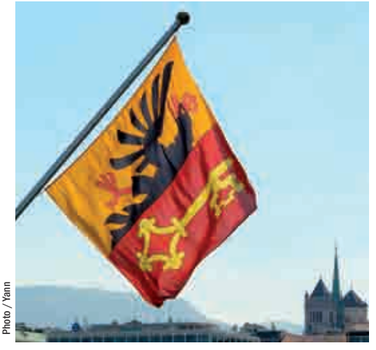
Geneva Cantonal flag

Fortunately, we enter this interim period with a running start, because the UNEP Global Mercury Partnerships has worked extensively to prepare governments particularly in improving knowledge of their national mercury concerns. We have a solid basis of information produced both through the partnership areas, and through the assessment work requested by UNEP Governing Council,