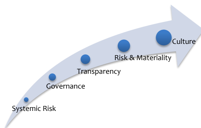
Figure 3: Evolving Financial Standards to Embed Sustainable Development

There is an opportunity to build on the synergies and extend the notion of sustainable development as international financial standards continue to evolve. This is not a straightforward task and the paper provides a number of suggestions as to how this might unfold, including the possible introduction of an overarching principle of “Maximum Social Benefit” that encapsulates the goals of sustainable development as they relate to financial standards in a coherent and consistent way.