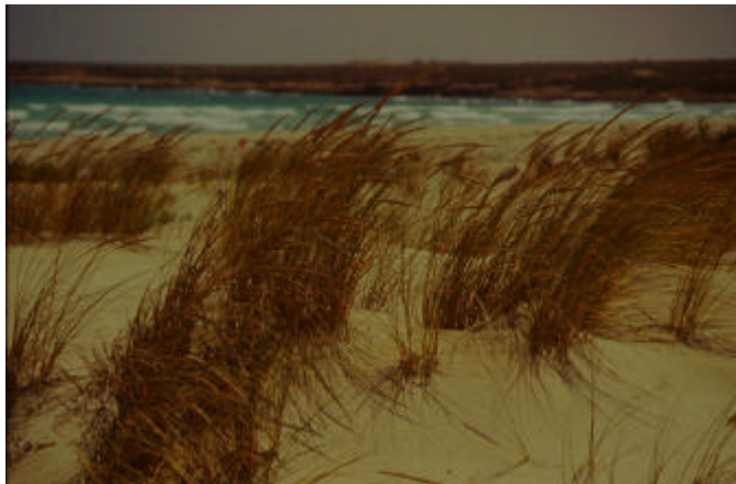
The plant formations stabilize the dunes and the beaches. M.N. Bradai

The main disturbance of the sandy environments comes from work done to develop tourist activity. Infrastructure development is the main threat hanging over sandy coastal environments. In countries where tourist development is rapid and uncontrolled, the littoral dunes constitute deposits of sandy material for building work. Removal of the sand brings about the disappearance of the plant formations that stabilize the dunes, which thus become vulnerable to erosion by water and – especially – wind. Dune environments, easily worked by public works equipment, are also choice environments for building the transport and accommodation infrastructure of seaside resorts. Channels that communicate with wetlands are also places that attract the building of sea walls and ports.