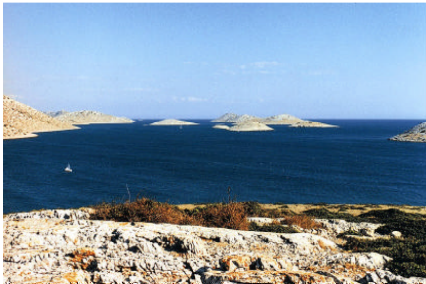
The Kornati islands National Park. D. Grlica

There are ten protected areas on the Croatian littoral, 5 National Parks and 5 Nature Reserves: the Brini Islands National Park, the Kornati Islands National Park, the Krka National Park, the Paklenica National Park, the Mljet National Park, the Limski Zaljev Nature Reserve, the Lokrum Nature Reserve, the Malostonski Zaljev Nature Reserve, the Neretva Delta Nature Reserve (Ramsar site), the Suma Dundo na Rabu Nature Reserve (Dundo Forest-Rab Island).