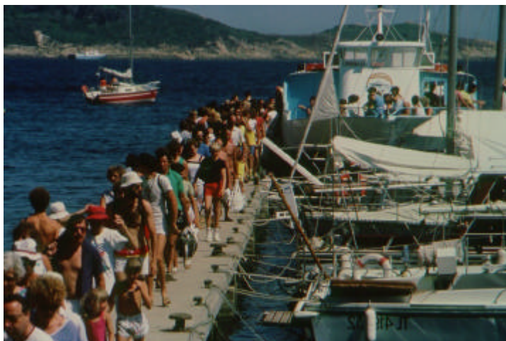
Seaside activities are major source of ecosystem disturbance.

sources of disturbance to fauna (monk seal, turtles), direct mortality by boats (turtles, sharks), and degradation of certain marine biocenoses (caves, by diving).