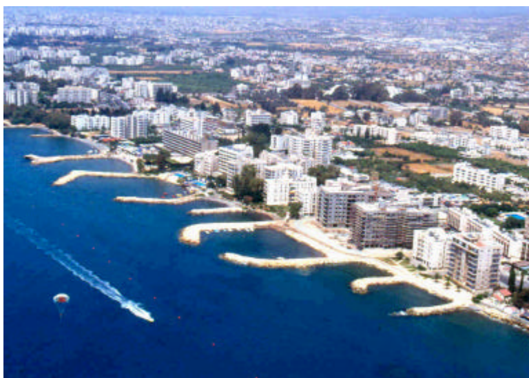
Increasing coastal urban development : Limassol. Andreas Demetropoulos

The main sources of impact listed in the National Report are, for the most part, related to privatization and to increasing coastal urban development. In view of the growing value of coastland? as a result of the considerable development of tourism? many areas of "untouched" land, previously devoted to agriculture, became the objects of real-estate speculation, whether for the construction of private villas or hotel complexes. This urban development/privatization of coastland was coupled with the building of roads and the development and over-exploitation of beaches, even though they were protected as reproduction sites for turtles, the building of small harbours, seawalls, groins and breakwaters? regardless of their long-term impacts such as coastal erosion? and various kinds of disturbance, such as night lighting, the use of power-driven gear to clean up beaches, trampling, etc. This resulted in the break-up of habitats, for the hotel complexes had been set up in the most interesting sites from the perspective of seaside tourism. However, it would appear that coastal pollution resulting from tourist installations was not of great consequence. Practically all the hotels, in particular the most recent ones, possess their own facilities for the treatment of waste water, and use the treated water for watering their gardens.