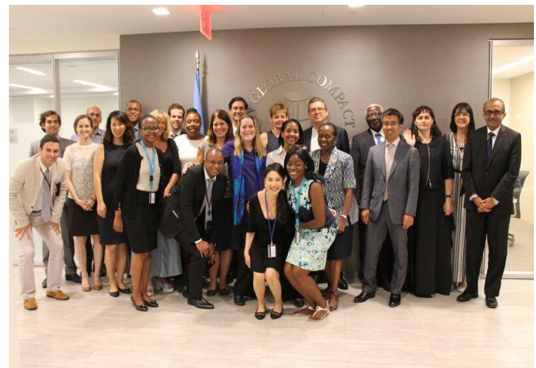
Participants at the Experts’ workshop in July 2016