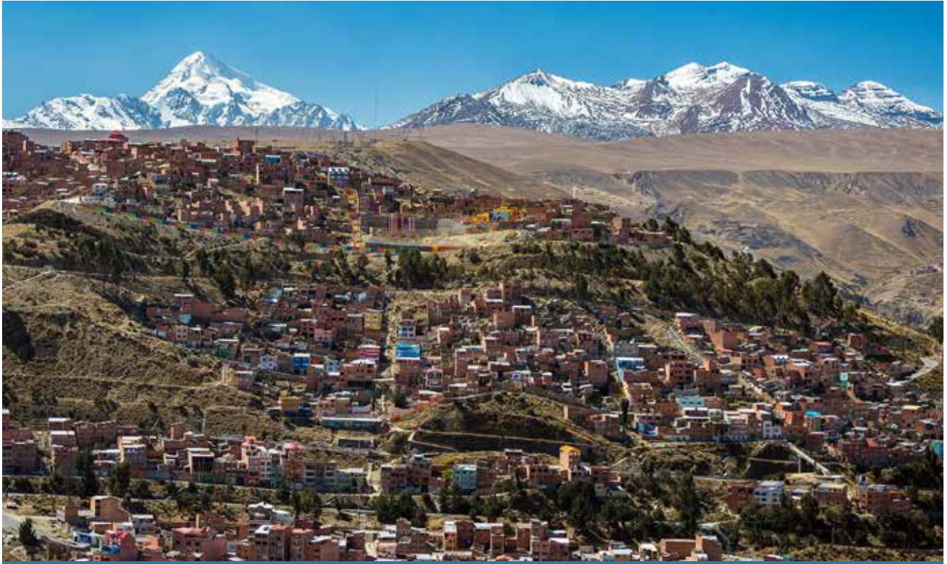
El Alto, Bolivia.