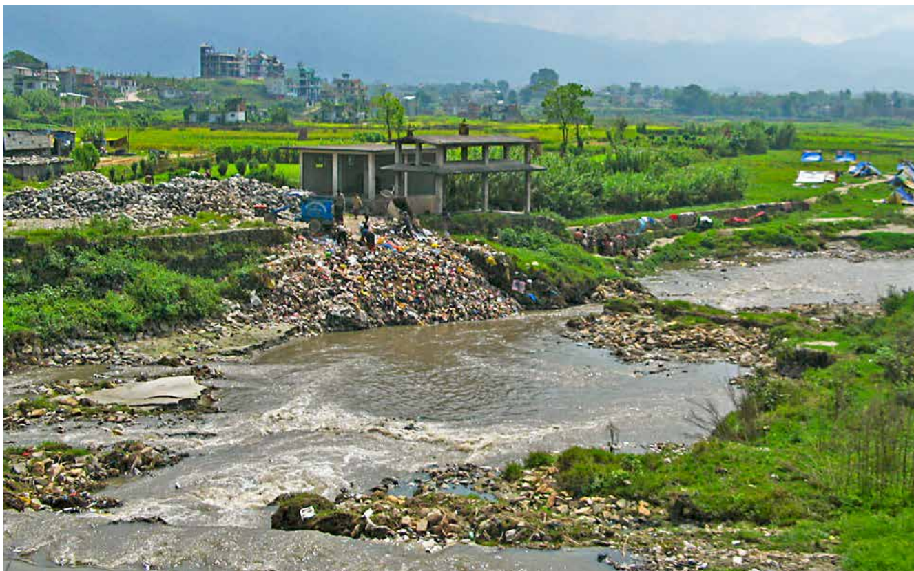
A waste dump on the edge of the Bagmati River, Kathmandu.

One of the main ways in which mountains are linked to lower-lying areas is through rivers. These rivers bring much needed water, but also carry plastic pollution downstream. There has been much attention in recent years on plastic pollution in the marine environment, but considerably fewer studies have so far studied the impact on freshwater environments. This is an area that deserves further attention.