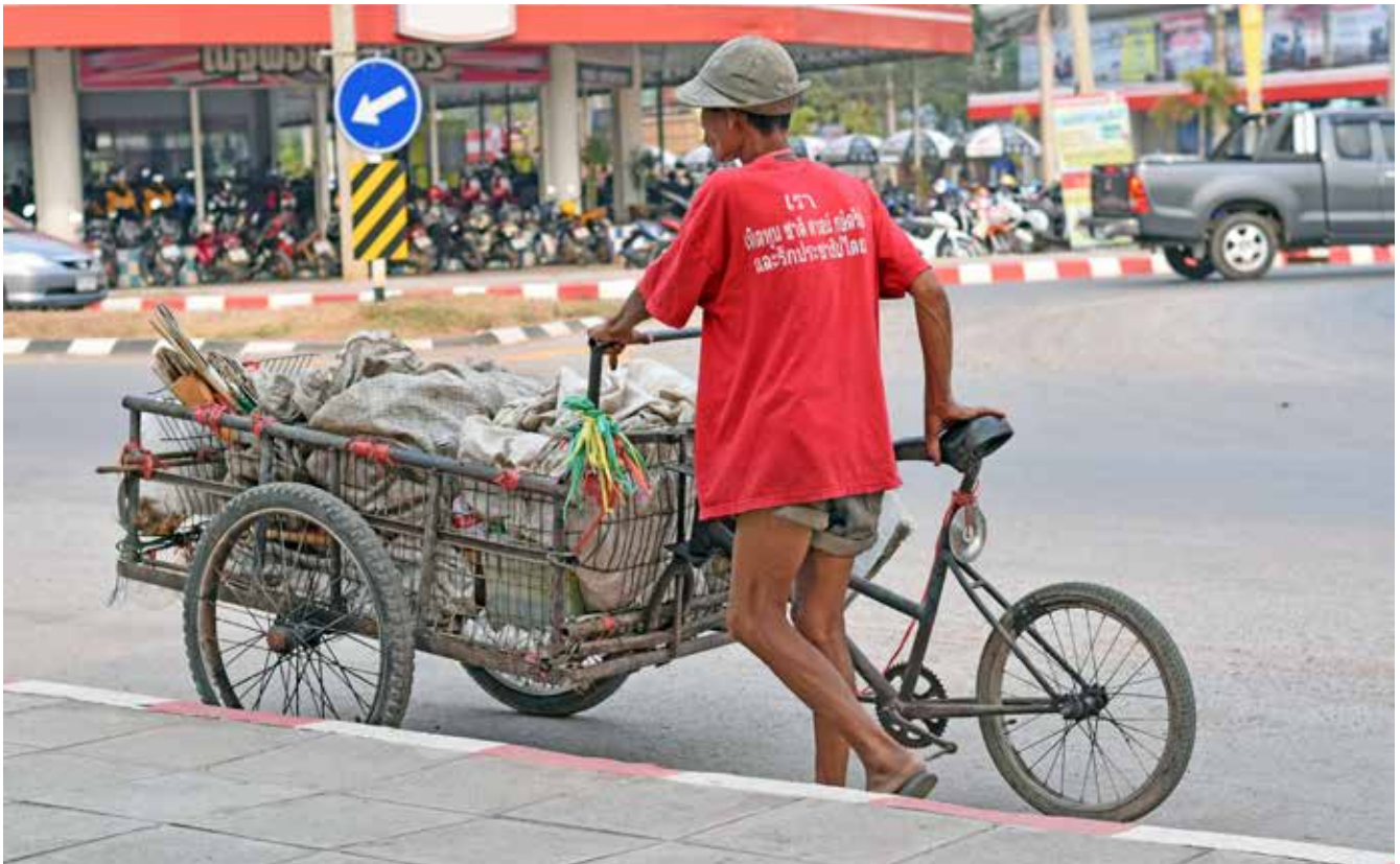
Informal recycling in Thailand.

Build awareness at all levels of the large potential downstream impacts and global nature of certain waste streams in mountain environments, and the threats posed to human health. The focus should be on people living in mountain communities and those who visit mountains on a temporary basis, such as tourists. This should start with