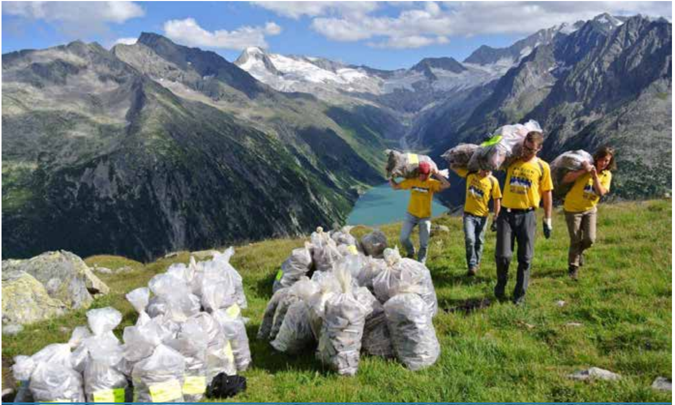
Volunteers collect waste during the “Clean Alps” campaign organized by the Austrian Alpine Protection Association.

promoting sustainable consumption through the 3Rs: reduce, reuse and recycle. Awareness raising should also talk about risks to public health of inappropriate disposal and treatment of waste and appropriate and economic alternatives. Open burning of non-biodegradable waste should be strongly discouraged or even banned. A preventative approach is needed to make sure that sustainable waste management practices are introduced before waste problems become too severe.