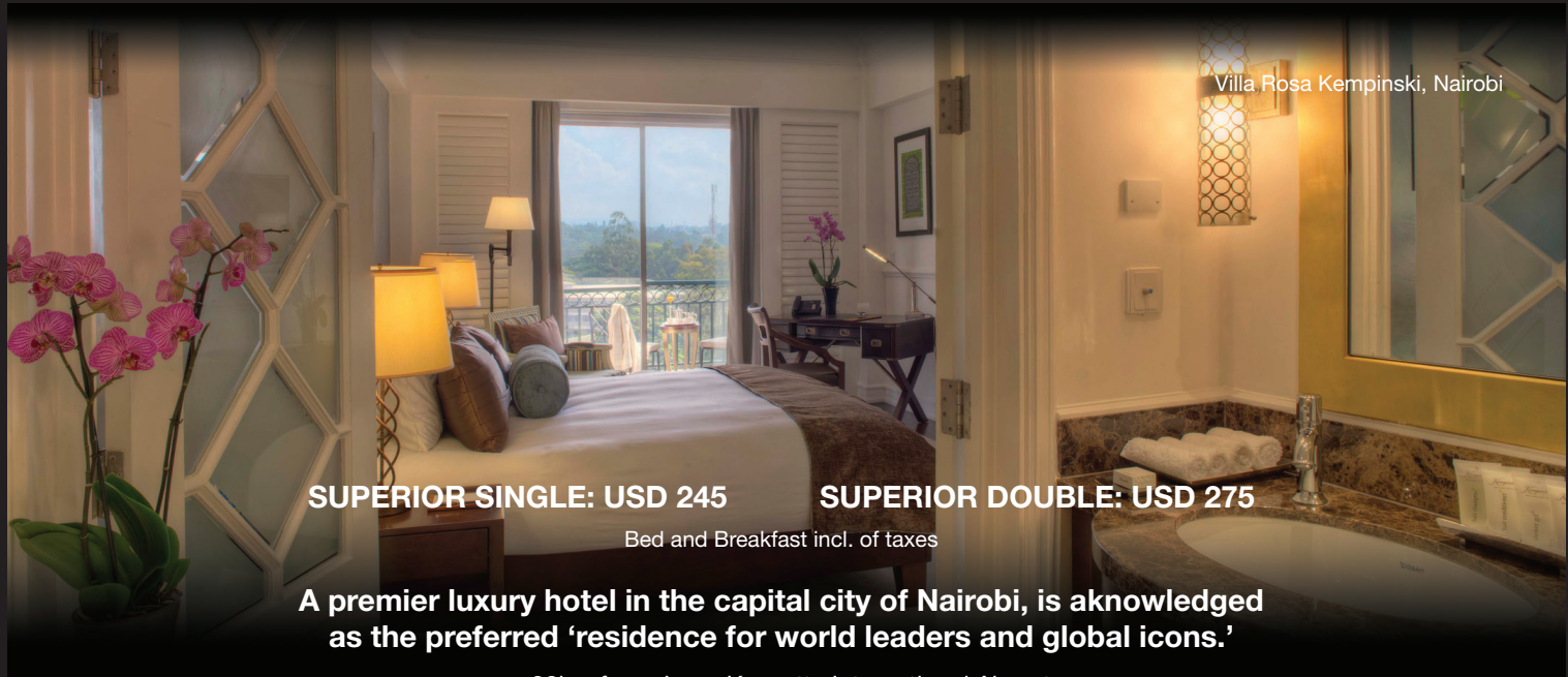
Villa Rosa Kempinski, Nairobi