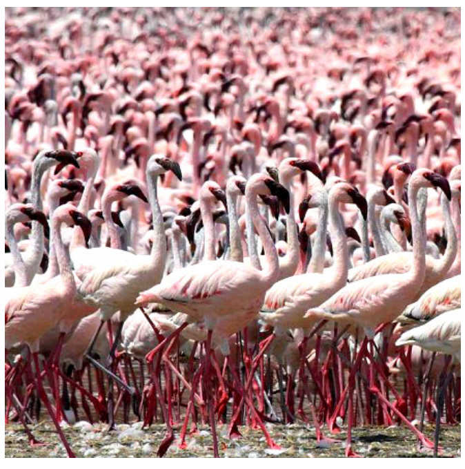
Lesser Flamingo covering Lake Bogoria to give it a beautiful light pink color

Lake Bogoria lies in a volcanic region in Kenya. It is often called a "soda lake" because of the high concentration of soda that oozes from the volcanic soil and mixes with the lake water. Lake Bogoria also has many hot springs "geysers" that pour boiling water into the lake. The Lake has over 200 geysers around it.