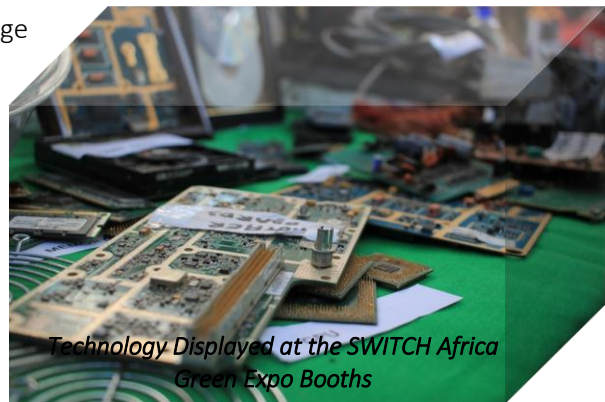
Technology Displayed at the SWITCH Africa Green Expo Booths

SWITCH Africa Green supports the exchange of knowledge and good practices not only among the countries, the grantees and MSMEs of the project but also regionally and globally. Twelve MSMEs recently participated in the sustainable innovation exhibition during the third United Nations Assembly (UNEA-3). Exhibitors were visited by the President of the UN General Assembly H.E. Miroslav Lajčák and received words of encouragement from the President who said: “I appreciate your creativity, congratulations, you are leading, I think the world should follow you.”