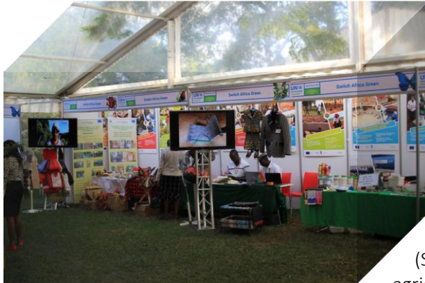
The SWITCH Africa Green Expo Booths

SWITCH Africa Green is funded by the European Union and implemented by UN Environment in collaboration with United Nations Development Programme and United Nations Office for Project Services. The SWITCH Africa Green project supports six countries in Africa - Burkina Faso, Ghana, Kenya, Mauritius, South Africa and Uganda - to achieve sustainable development by engaging in the transition towards an inclusive green economy based on sustainable consumption and production (SCP) patterns. It focuses on selected sectors: agriculture, integrated waste management, manufacturing and tourism.