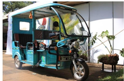
The Electric Tuk Tuk

Dave TukTuk's new electric Tuk Tuk 1 provides a non-polluting and silent transport system for Kenya's urban and rural areas. The vehicle has fuel costs at 12.5% of what a gas-powered vehicle does. This electric Tuk Tuk is meant to be an alternative to the current noisy and polluting Tuk Tuk. The company notes that the most important thing is education in the market. Often, people hear about the electronic Tuk Tuk and do not understand what it is. They are aiming to sensitize people in order to successfully introduce this new Tuk Tuk. To date, they are the only company in East Africa offering this product and are aiming to sell to the mass market.