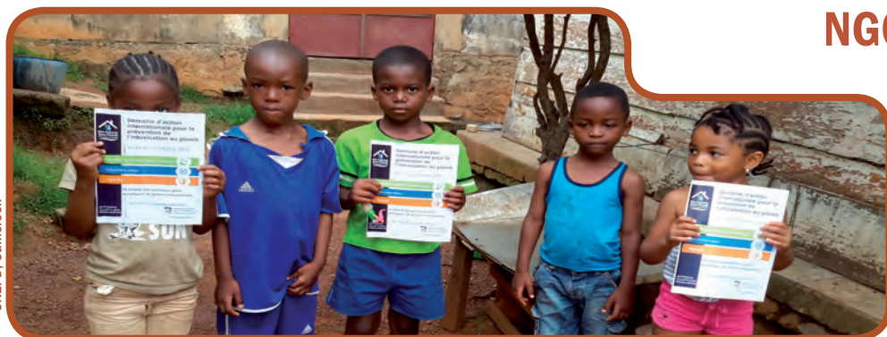
International Lead Poisoning Prevention Week in Cameroon