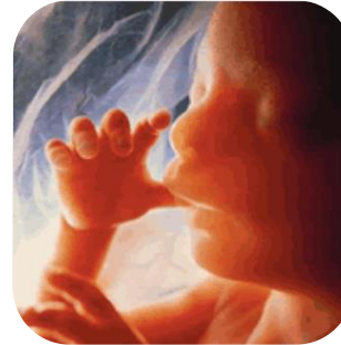
Endocrine- disrupting chemicals