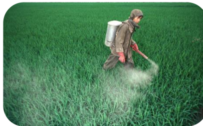
Highly hazardous pesticides