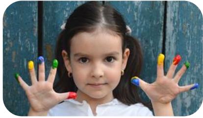
Lead in Paint