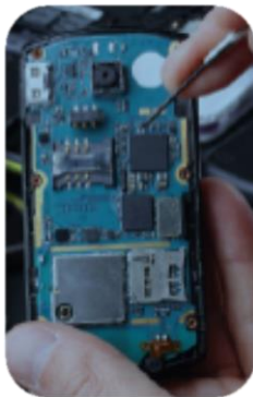
Lifecycle of electronics