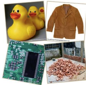
Chemicals in Products