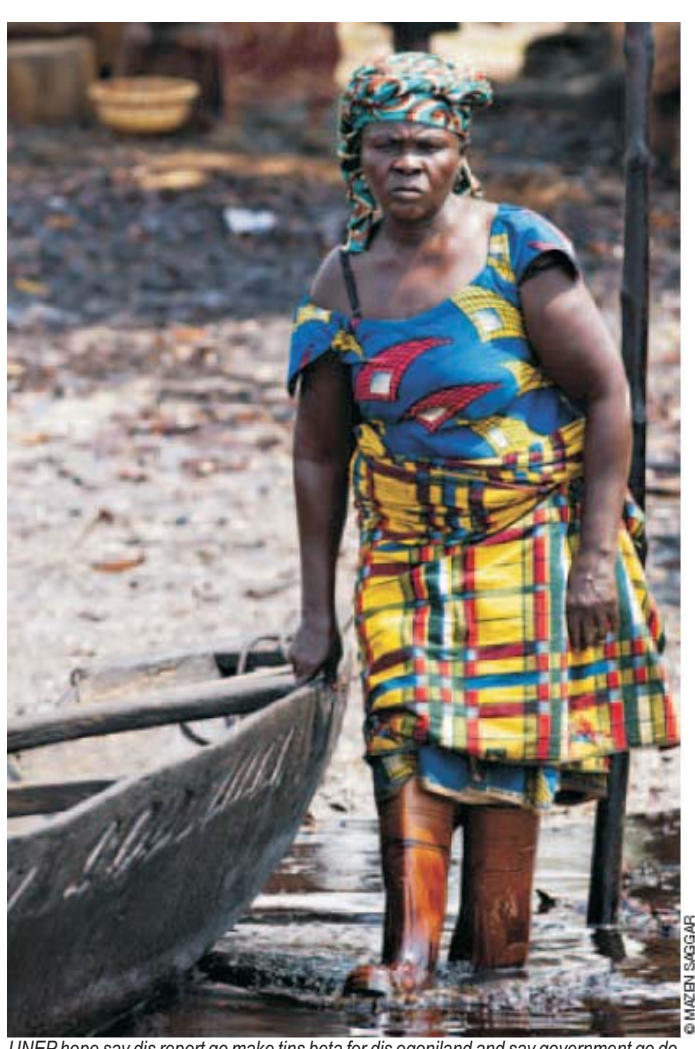
UNEP hope say dis report go make tins beta for dis ogoniland and say government go do sometin quick quick

De tori wey come out of dis report torch lighting wey UNEP do na im dey put for de 258 page report an for 67 oda report wey look de mata one by one. All of dem pass 1,000 pages na im make dem do dis one small like this.