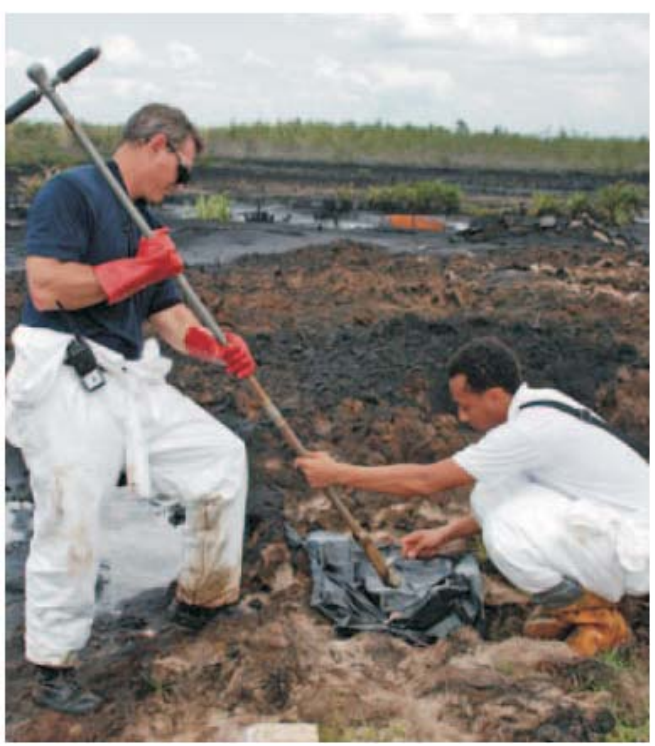
De report talk say oil pollution don spoil de ground

Hydrocarbons – naturally occurring organic compound comprising hydrogen and carbon (most common are natural gas and oil) µg/l – migrogram per litre mg/kg – milligram per kilogram