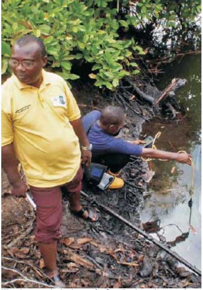
Wen dem wan do de cleanup for Ogoniland e go better make government arrange de people wey go dey check how de oil company dem dey do der business for dia

The oda tins wey UNEP say make government do be say, make dem setup one agency wey dem go call Ogoniland Environmental Restoration Authority, na dis agency na e go sedon on top the cleanup.