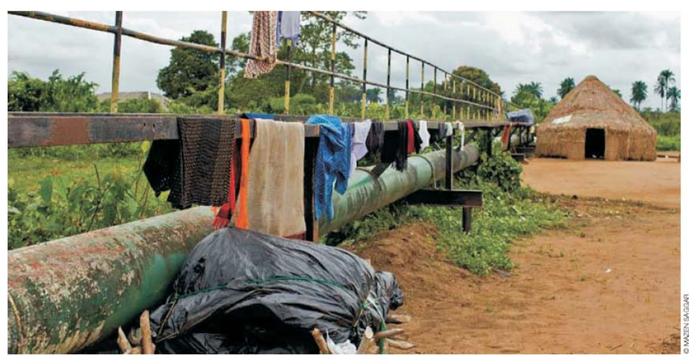
De oil wey dey comot for ground don dey give Nigeria money for de pass 50 years but many people de suffer because of am