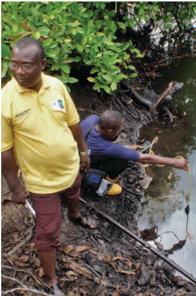
During and following clean-up operations in Ogoniland, a monitoring programme should be put in place