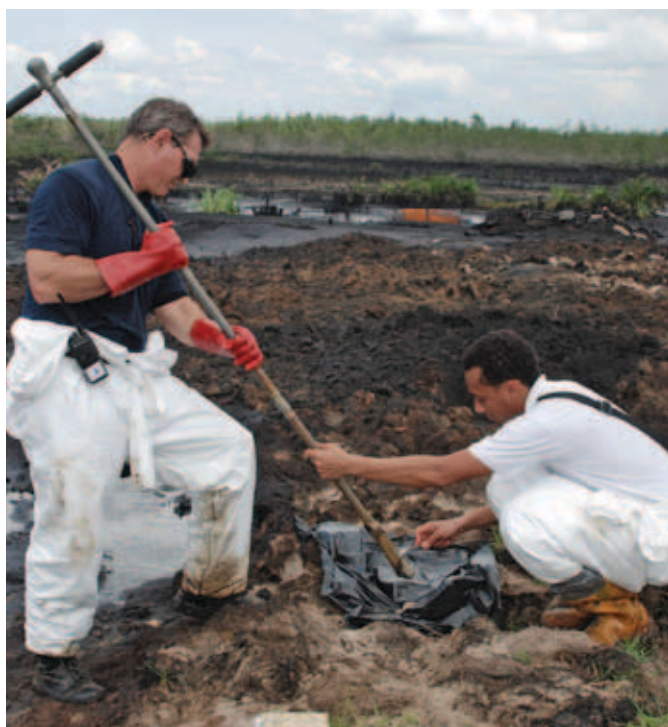
The report concludes that pollution of soil by petroleum hydrocarbons in Ogoniland is extensive in land areas, sediments and swampland