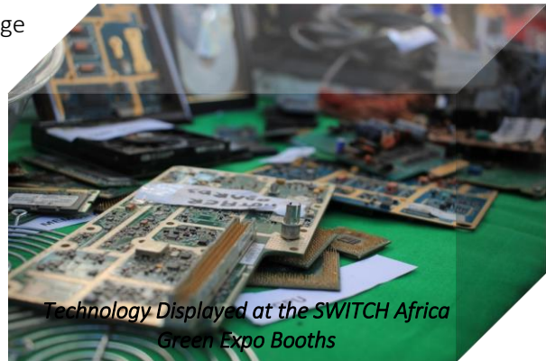
Technology Displayed at the SWITCH Africa Green Expo Booths

SWITCH Africa Green supports the exchange of knowledge and good practices not only among the countries, the grantees and MSMEs of the project but also regionally and globally. Twelve MSMEs recently participated in the sustainable innovation exhibition during the third United Nations Assembly (UNEA-3). Exhibitors were visited by the President of the UN General Assembly H.E. Miroslav Lajčák and received words of encouragement from the President who said: "I appreciate your creativity, congratulations, you are leading, I think the world should follow you."