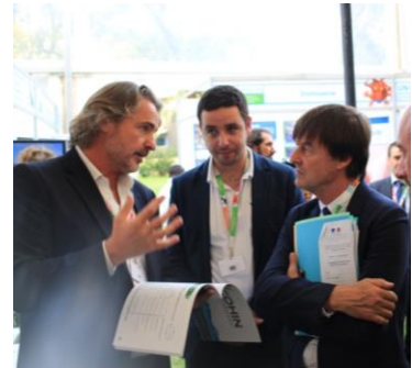
French Minister of Environment, H.E. Nicolas Hulot, speaking with participants of the Expo

Business France is France's national agency supporting the international development of the national economy, responsible for fostering export growth by French businesses, as well as promoting and facilitating international investment in France. It promotes France's companies, business image and nationwide attractiveness as an investment location through the Creative France campaign, and also runs the VIE international internship program. Business France East Africa supports French companies to find local partners in Tanzania, Kenya, Ethiopia and Uganda. Business France attended the Expo with a group of French companies working in a range of areas including solar, water, biogas, industry, and business.