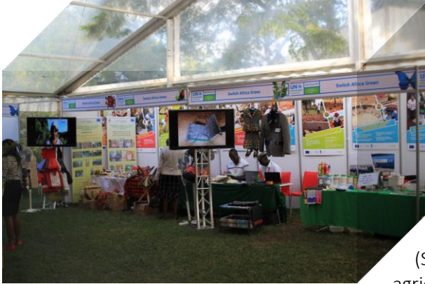
The SWITCH Africa Green Expo Booths

SWITCH Africa Green is funded by the European Union and implemented by UN Environment in collaboration with United Nations Development Programme and United Nations Office for Project Services. The SWITCH Africa Green project supports six countries in Africa - Burkina Faso, Ghana, Kenya, Mauritius, South Africa and Uganda - to achieve sustainable development by engaging in the transition towards an inclusive green economy based on sustainable consumption and production (SCP) patterns. It focuses on selected sectors: agriculture, integrated waste management, manufacturing and tourism.