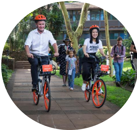
Left: Mr. Erik Solheim, Executive Director of UN Environment, riding a Mobike with; Right: Ms. Hu Weiwei, Founder of Mobike.