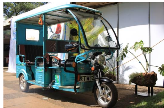
The Electric Tuk Tuk