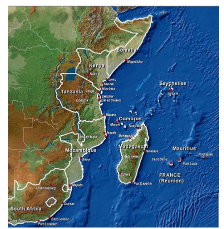
Figure 3 Map of the Western Indian Ocean (WIO) countries including the island states of Madagascar, Reunion and Mayotte, Mauritius, Comoros, Seychelles.

Figure 1 Concentrations of carbon species ( \mu mol kg<sup>-1</sup>), pH values, and aragonite and calcite saturation states of average surface seawater for pCO<sub>2</sub> concentrations (ppmv) during glacial, preindustrial, present day, two times pre-industrial CO<sub>2</sub>, and three, times pre-industrial CO<sub>2</sub> (from Fabry et al., 2008).