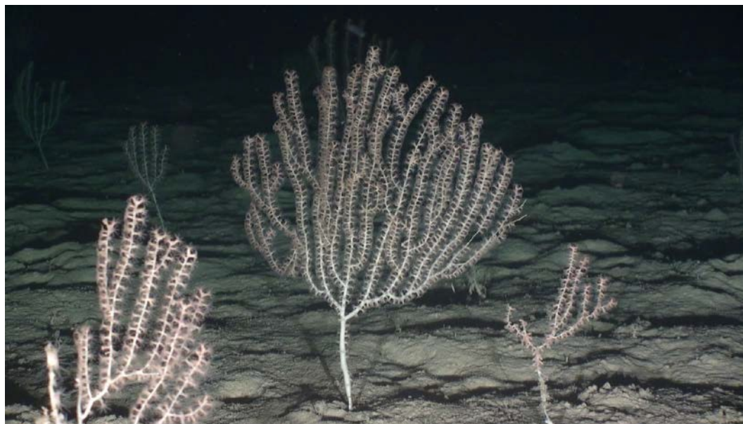
Fig. 3 Isidella elongata population in the Ausiàs March Seamount (Balearic Islands) at around 500 m depth. A large specimen is visible in the centre of the image.