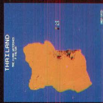
UNEP/GENS/GRID - UNEP/ROAP