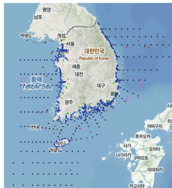
Fig. 3.2. Map showing the locations covered by the Korea Marine Environmental Monitoring Network (MEM-Net)