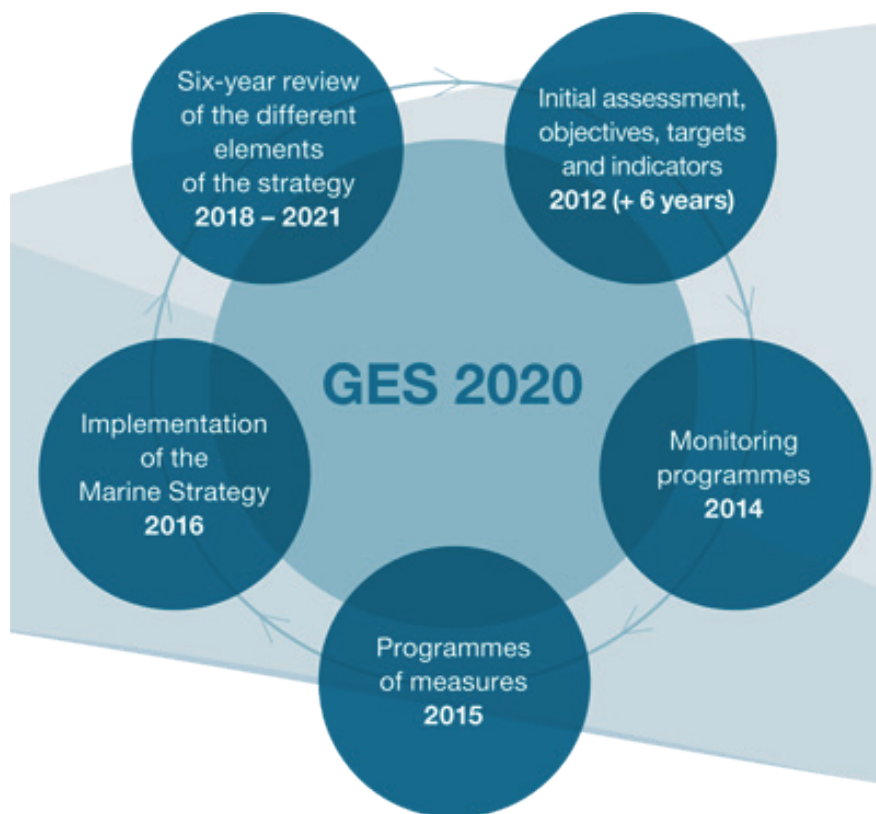
Fig. 2.1. What does a Marine Strategy include?

In 2008, the European Commission (EC) has adopted the Marine Strategy Framework Directive (MSFD) requesting member states to achieve before 2020 Good Environmental Status (GES) in their marine areas. The process of achieving GES is shown in Fig. 2.1 below. However, an interim assessment undertaken in 2014 has shown that the development of indicators and targets by the EU member states took longer than expected and many shortcomings have been revealed. More information could be found on the web: http://ec.europa.eu/environment/marine/eu-coast-and-marine-policy/marine-strategy-framework-directive/index_en.htm