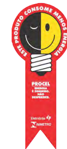
Label Endorsement Brazil