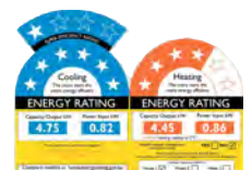
Label Comparative Australia