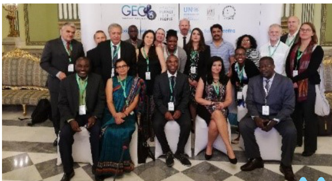
Some of the Review Editors

During the meeting, the Review Editors decided that the role of the Review Editors was to assess how well the review comments had been addressed by the authors and although there may have been some areas of the text that they might have wished to comment on, they should only bring issues of significant errors to the attention of the Secretariat. The Review editors also agreed that proper categorization of the comments allow for more thorough analysis of the results and additional functionality needed to be added to the Review Editors Analytical Database (READ) to allow queries for country-level peer review comments. This would allow for responses to specific countries who wish to know how their comments were dealt with by the authors.