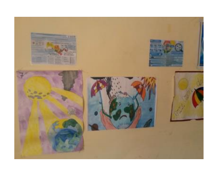
Open lesson at the School #3. Jizzah region.

The entertainment programme where about 60 children of "Mehribonlik" orphanages took part, delivered the final chord of events dedicated to celebration of the International Day for the Preservation of the Ozone Layer.