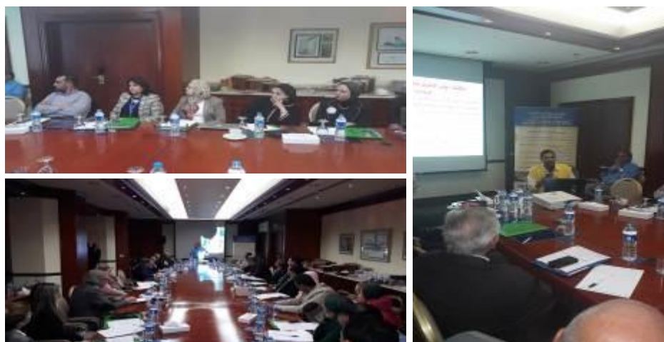
Preparation of the National Strategic Action Plan (2017-2022)