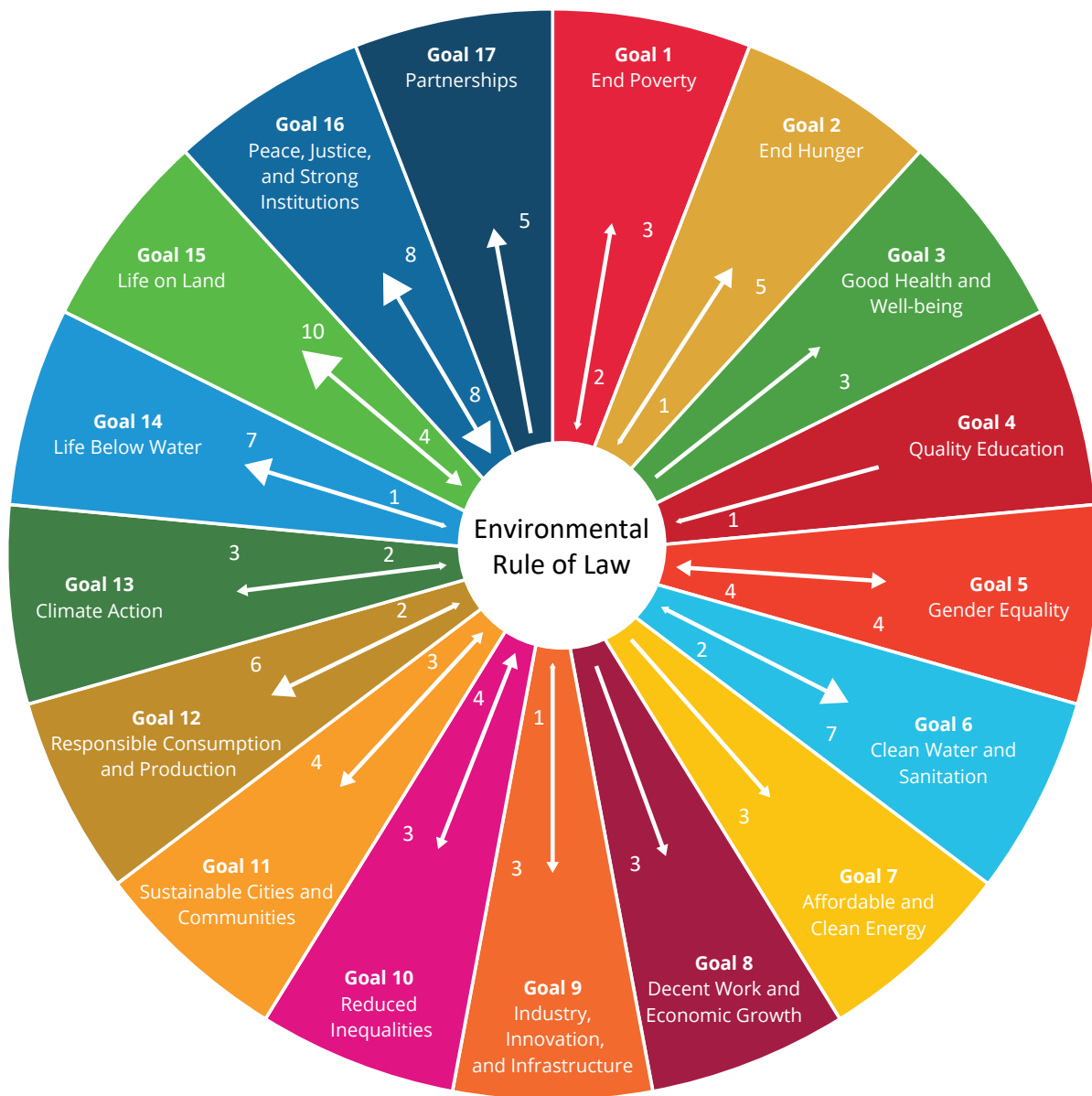
Figure 6.1: Environmental Rule of Law and the Sustainable Development Goals

Notes: An arrow pointing toward the goal indicates that environmental rule of law supports its achievement, and an arrow pointing from a goal indicates that it supports environmental rule of law. Many are mutually reinforcing. Numbers denote the number of each goal’s targets that are considered to support or be supported by environmental rule of law. Because some targets both support environmental rule of law and are in turn supported by it, the numbers for some goals may total more than the number of targets enumerated for that goal.