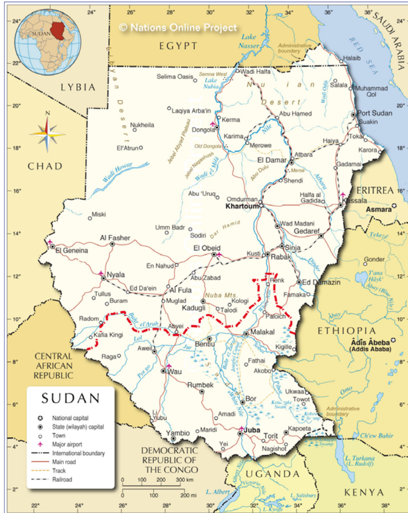
Figure 1. Political map of Sudan, 2013/19