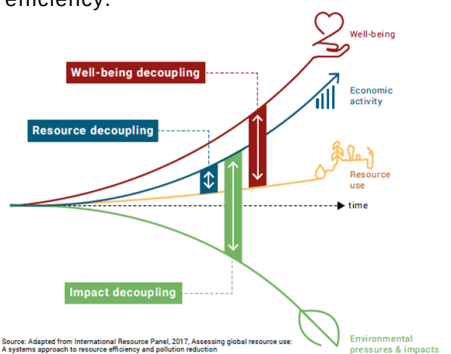
Figure 3: The concept of decoupling.

There are sectors that contribute a substantial proportion to the world's material footprint. Globally, on average, the agriculture, food and construction sectors accounted for 70 per cent of the world's total material footprint in 2015. In addition, over 60 per cent of the urban infrastructure planned to be in place by 2050 has yet to be built, with extraordinary implications for the environment and natural resources. Thus, efforts to decouple economic growth from environmental degradation in these sectors in particular could pay substantial dividends in meeting the targets of both SDG 8 and SDG 12. Further analysis of these high impact sectors can guide policies to significantly improve resource efficiency.