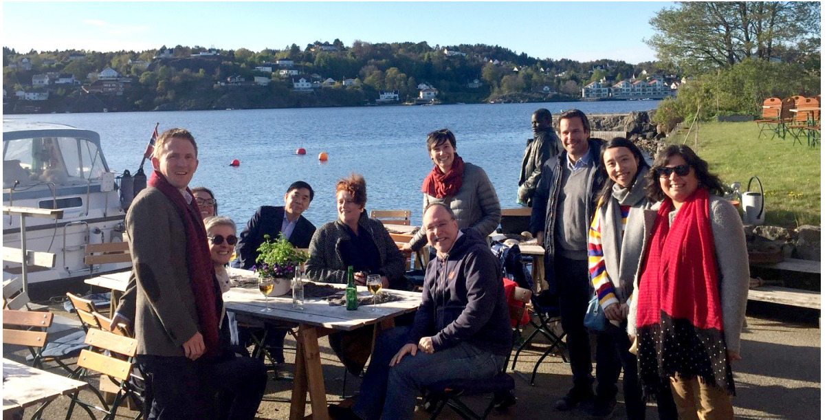
Participants of the GEO for Cities Meeting

The group then gave some comments on outreach and timeline. The Advisory Committee suggested that GEO for Cities could be launched on October 2020 during Convention on Biodiversity Diversity (CBD) and the timeline would extend a little bit longer following this schedule. The first authors meeting would move to late August 2019 to have more time for choosing authors. It was agreed that Advisory Committee would be involved in the internal review period and join the second authors meeting. The Secretariat will address all the comments and share the revised timeline after the meeting.