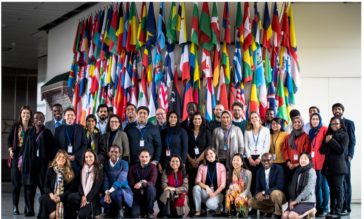
Group Photo of GEO for Youth Participants