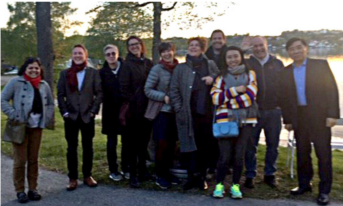
Participants at the Inception Meeting

The group emphasized that the target audience should be clear, although local government plays the main role in city issues, national governments could also be considered. Also, it was agreed that GEO for Cities should be different from other assessments. More information could be built on biodiversity issues since most assessments focus more on climate change. Planetary boundaries, infrastructure development, changes in social behaviours, economic growth, inequality are all the drivers of environmental issues in cities and could be added to supplement GEO-6. Thereafter, the Co-Chairs led a brainstorming discussion on target audiences, approach and scope/niche to move the process forward.