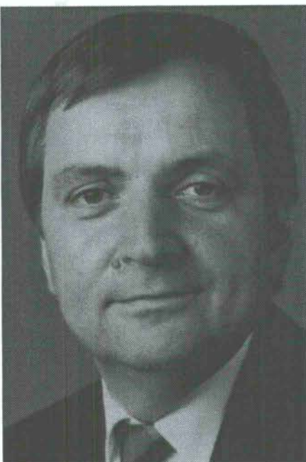
Klaus Töpfer Executive Director United Nations Environment Programme

As we approach the beginning of the 21 st century we must commit ourselves to delivering a sustainable higher standard of living to all people, I hope that this Guide will assist its users in finding new ways, individually and collectively, to understand, learn and act for the environment.