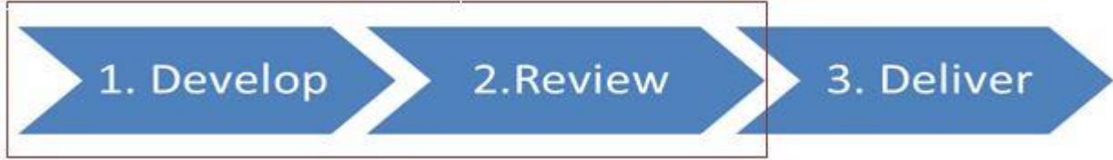
Fig. 1: Phases in strategic planning

This draft roadmap covers phases one and two of the three key phases, in line with the process shown below: