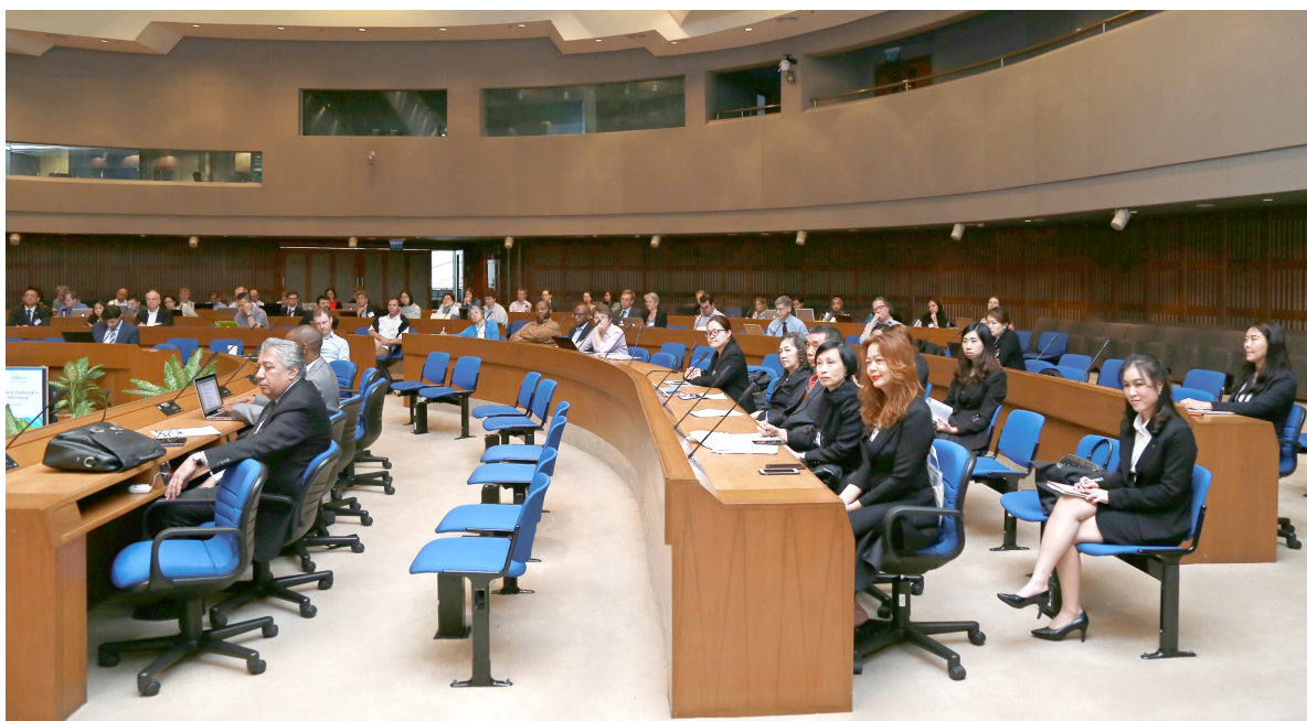
Participants of the second global authors meeting during one of the sessions

Global Environment Outlook Fellows attended all five days of the meeting and focused on providing research support for the Global Environment Outlook author teams. To provide guidance and leadership, the Global Environment Outlook co-chairs and vice-chairs circulated amongst the drafting groups to observe and provide thoughts on the overarching themes and focus areas of the sixth edition of the Global Environment Outlook. Co-chairs and vice-chairs of the Scientific Advisory Panel (SAP) were also present in the discussions of the drafting teams. The UN Environment Secretariat provided administrative and technical support. Selected UN Environment content experts also provided support to the author teams on data and literature issues.