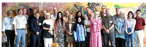
Members of the Scientific Assessment Panel (SAP) with representatives from the regional Global Environment Outlook assessments

The Scientific Advisory Panel (SAP) was established to guide the assessment process and to ensure scientific credibility and overall quality and integrity of the sixth Global Environment Outlook. The Panel was selected through the nomination and engagement process and comprises experts from each UN Environment region and up to six global experts. The Scientific Advisory Panel is supported by UN Environment's Chief Scientist Office.