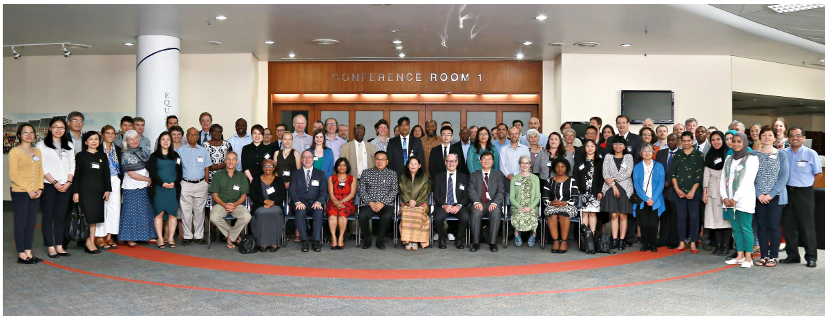
Participants of the second global authors meeting pose for a group photo at the UN Conference Centre in Bangkok, Thailand

In parallel, authors of the Policy Effectiveness chapters met to develop their annotated outline and portions of the text for these key chapters of the global assessment. Similarly, the Innovative Outlooks Group came together to expand their annotated outline and draft their work plan for the Outlooks chapters of the global assessment. They also conducted a ground-truthing and visioning workshop that included Outlooks authors, Global Environment Outlook co-chairs and vice-chairs, Policy Effectiveness authors, Data authors, UN Environment's Chief Scientist and invited stakeholders from the Asia-Pacific region.