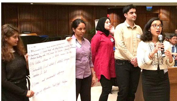
Participants at the stakeholder workshop

The Innovative Outlooks Group had its first stakeholder workshop on May 25, 2017, in Bangkok, Thailand. This workshop was the first in a planned series of workshops to be held on different continents. The purpose of this workshop was: