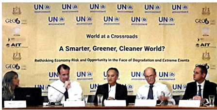
Panel members at the media and outreach event at the Foreign Correspondent's Club in downtown Bangkok

The next author's meeting in Guangzhou, China (9-13 October 2017) could see a broad engagement with Chinese business. Media and outreach events could be organized in Guangzhou to once again raise the profile of the Global Environment Outlook with the messaging for these events likely focusing on the business community.